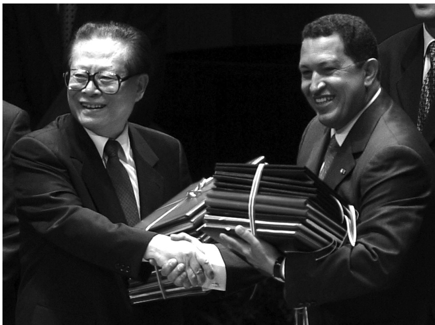
Chinese President Jiang Zemin, left, and Venezuelan President Hugo Chavez exchange signed agreements in Caracas, Venezuela, 17 April 2001. Jiang and Chavez signed accords on agriculture, taxation, and energy.

Despite China's ambiguous public posture, it is clear that its relationship with Latin America generally, and Venezuela specifically, is rapidly expanding. Just a decade ago, China was viewed as a peripheral actor in the region; today, though far from being a dominant player (China only accounts