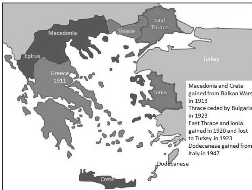
Figure 1. Map of Greek Territorial Expansion

for centuries. 8 Slavic-language speaking peoples, instead of Greek speakers inhabited these new territories. Additionally, the majority of the refugees from Asia Minor, who spoke Turkish, settled in the northern territories. These factors created a northern population in Greece that the Greek-speakers in the more affluent south suppressed and alienated, leading these northern areas to be a reliable base of support for the future communist movement. 9 The economic hardships led to the formation of the Greek Communist Party (KKE) in 1918. 10 The KKE had a poor showing at its first election in 1923, but continued to grow. 11