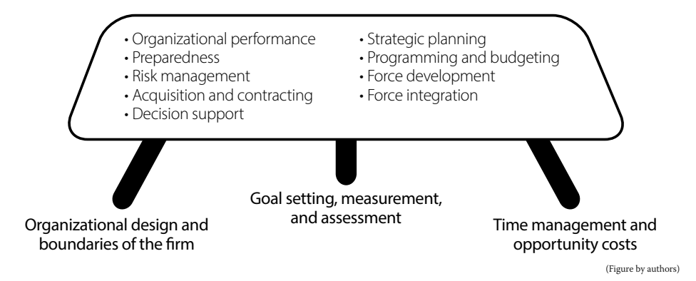
Figure 3. Nine Components of Defense Management Domains of Knowledge

ample, fundamental measures of preparedness for military operations include having sufficient quantities of ready on-hand capabilities, overmatch of capabilities against an opponent, the balance of readiness and modernization, and the will to employ them.<sup>56</sup> These measures may apply differently between the unit level (e.g., personnel and materiel on hand and available) and the national level (e.g., number or capability of forces to meet combat commanders' missions).<sup>57</sup> However, understanding these fundamentals should help defense managers address commonalities and differences between the two perspectives to present a synthesized assessment.