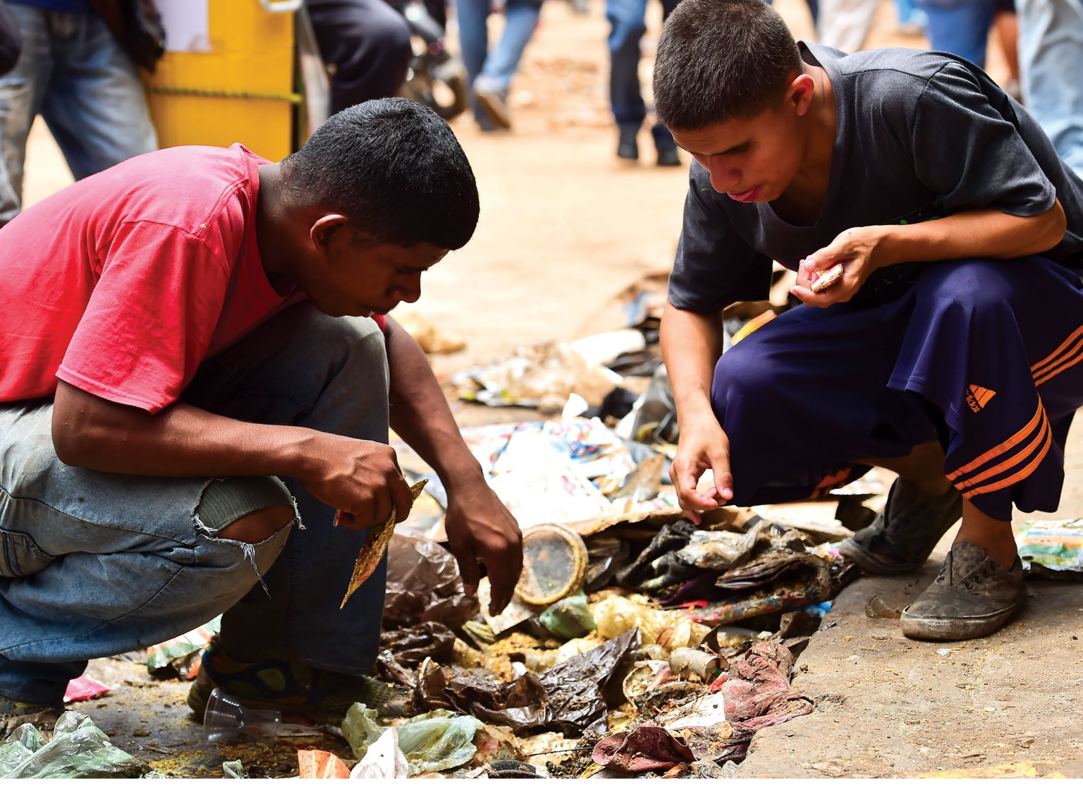
People look for food in garbage dumped outside a looted supermarket 21 April 2017 in the El Valle neighborhood of Caracas, Venezuela, after demonstrations against the government of Venezuelan President Nicolás Maduro.