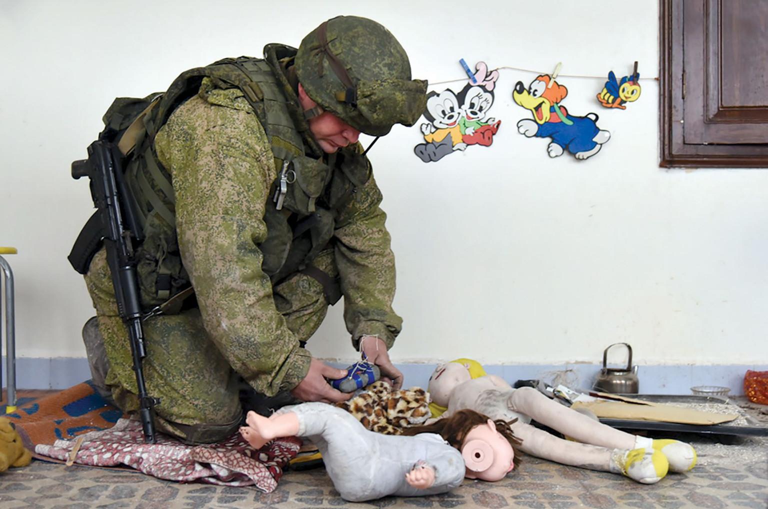
An army engineer from the Russian International Mine Action Center disarms a booby trap 3 February 2017 in a residence in Aleppo, Syria.