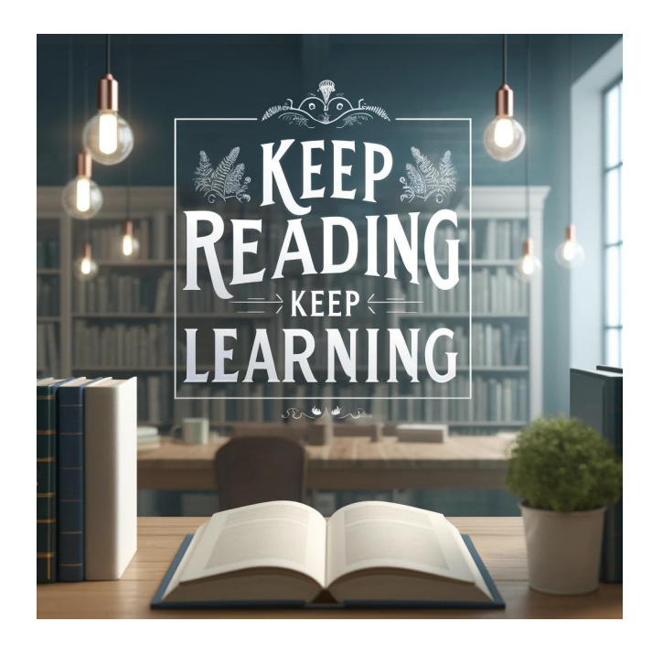
Page 69 | Volume II, Issue 1

This book is one of the most well-respected investigations of the strategic and tactical policies of the U.S. Army during the 20th century. Crackling with keen insight and clarity, this invaluable resource has renewed the study of strategy and its vital relationship to the art of war. Drawing heavily on the brilliant theories of the great Prussian general Carl von Clausewitz, this is the definitive politico-military assessment of the Vietnam War. Instead of merely examining the individual strategic flaws of the conflict, the book embraces a larger scope: how the weak relationship between military strategy and national policy led to the Vietnam War's unpopular and faulty definition – and eventual failure. Particularly relevant today, this important exposé stresses the futility of any military action without the full support and involvement of the country's people.