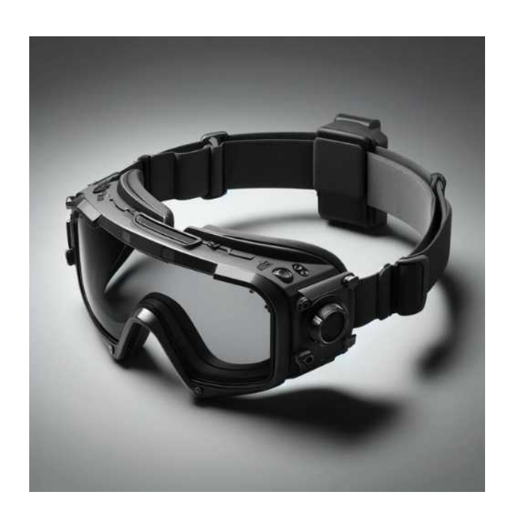
Page 15 | Volume II, Issue 1

Even the engineering solutions mentioned earlier need realistic, practical training. As long as a human in the cockpit can develop SD and make instinctual control movements, they must be trained to rely on those systems. This liquid crystal technology can be used to train these engineering controls. What good is training with advanced systems if the pilots are not in a degraded visual environment and are not forced to use the information and systems provided? Will they trust the tools supplied if they don't see their work firsthand?