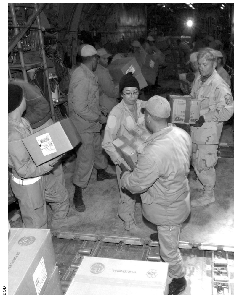
U.S. Air Force C-130 crewmembers and Iranian soldiers offload 20,000 pounds of medical supplies two days after a devastating 2003 earthquake in Iran.