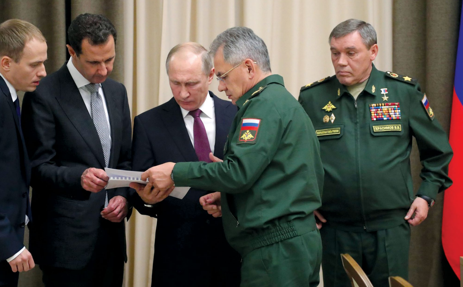
President of the Syrian Arab Republic Bashar Assad ( second from left), Russian President Vladimir Putin ( center left), Russian minister of defense General of the Army Sergey Shoygu ( second from right), and chief of the general staff of the Russian Federation armed forces General of the Army Valery Gerasimov ( right) meet 21 November 2017 in Sochi, Russia, to discuss the closing phases of Russian support for operations in Syria.