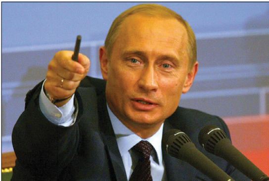
Russian President Vladimir Putin during his annual Question and Answer Conference, 4 October 2008.