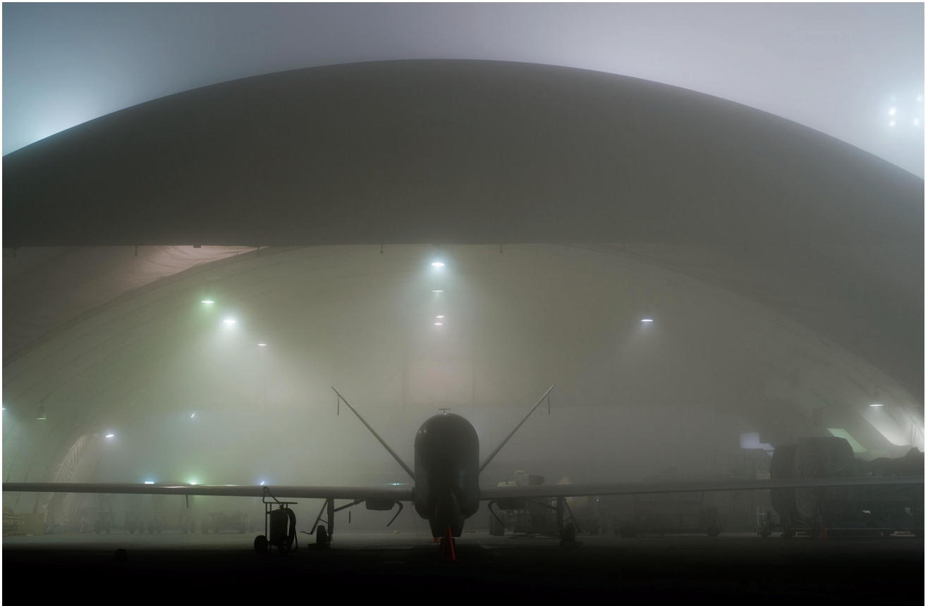
An RQ-4 Global Hawk awaits standard maintenance while a heavy fog rolls across the 380th Air Expeditionary Wing flightline at an undisclosed location in southwest Asia 12 January 2017. Global Hawks have provided coalition partners such as the Iraqi security forces with accurate intelligence necessary for precisely striking important Daesh facilities and supply routes in support of Combined Joint Task Force-Operation Inherent Resolve.

The development of a battlefield framework in Iraq in early 2016 based on the doctrinal close, deep, and rear construct was central to creating a common targeting picture that enabled federated target development and the application of multiple means—lethal and nonlethal—in a coherent way. It also allowed a nesting of inform-and-influence efforts by multiple actors from across the coalition and those who were operating from both inside and outside of Iraq. Even without direct interaction between actors, the framework allowed self-synchronization and deconfliction. This also provided a mechanism through which the employment of scarce assets such as ISR and strike could be regulated and applied. Also pivotal to dealing with the complexity and range of cross-domain action by multiple actors was the development and employment of a purpose-designed assessment methodology that was tailored to mission and grounded in a systematic analysis of measures of both effectiveness and performance tied tightly to mission objectives. 6 This