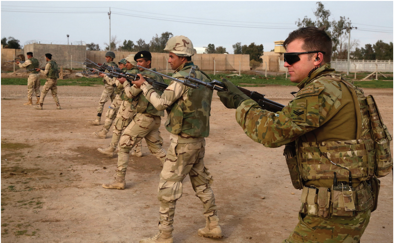
An Australian soldier assigned to Task Group Taji conducts bayonet training 3 January 2016 with soldiers assigned to the 71st Iraqi Army Brigade at Camp Taji, Iraq. The combined task group consisted of around three hundred Australian Defence Force personnel drawn largely from the Australian Army's 7th Brigade, alongside approximately 105 New Zealand Defence Force personnel. This training was critical to enabling the Iraqi security forces to counter Daesh as they worked to regain territory from the terrorist group.

new ways to access and apply the full range of available capabilities. The premier example of this in Iraq 2016 was the evolution of a “new,” holistic way of looking at targeting that evolved to encompass and apply all possible means to defeat the enemy. The “old” ideas of kinetic and nonkinetic, and lethal and nonlethal, proved inadequate to capture the full range of options available. Traditional kinetic targeting was merged with the application of “all available means” capable of informing and influencing the enemy and the operating environment. This had to be founded on a comprehensive understanding of the enemy, the operational environment, and the friendly force set. Systemically, it also led to the breaking down of traditional specialty “silos” to build an “all means” approach to targeting enemy vulnerabilities through all domains. This is likely to remain one of the pivotal skills on any future multidimensional battlefield.