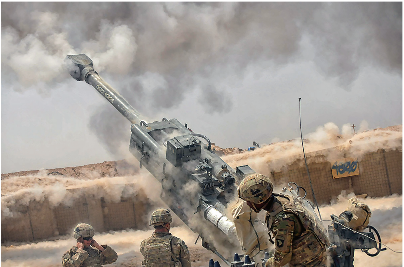
Soldiers with Battery C, 1st Battalion, 320th Field Artillery Regiment, Task Force Strike, execute a fire mission with an M777 howitzer 7 August 2016 during an operation to support Iraqi security forces at Kara Soar Base, Iraq. Battery C soldiers supported the Combined Joint Task Force—Operation Inherent Resolve mission by providing indirect fire support for Iraqi security forces as they continued to combat Daesh and retake lost terrain.

military deception around a small “economy-of-force” Iraqi ground maneuver force caused the enemy to break and run without fighting. Kinetic fires were comprehensively integrated, and the result approached very close to the MDB ideal. The fires solution was effectively “service agnostic,” and was often selected from a range of options sourced from across a coalition joint force.