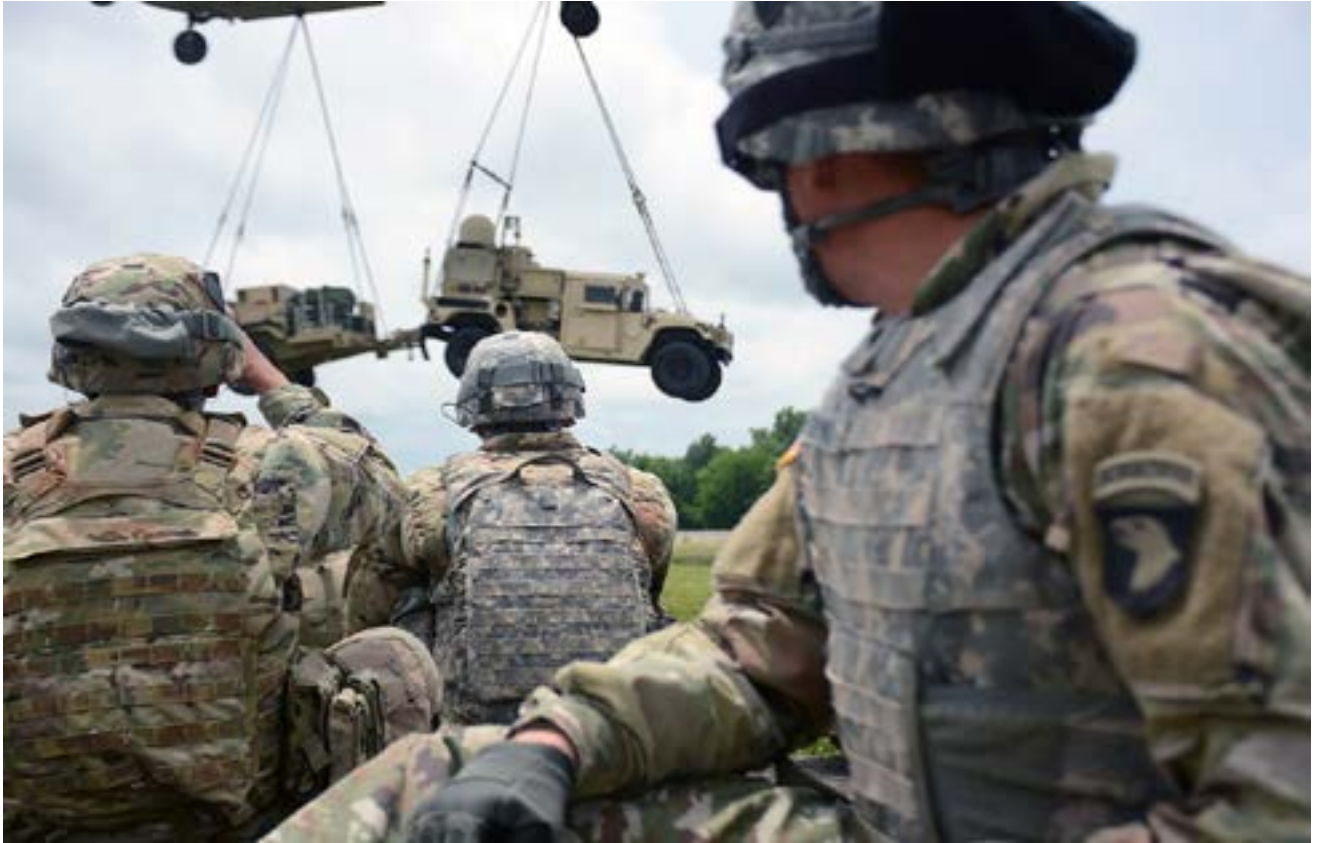
Soldiers from the 2nd Brigade Combat Team, 101st Airborne Division (Air Assault), watch as a CH-47 Chinook flown by soldiers from the 101st Combat Aviation Brigade, 101st Airborne, sling loads the Tactical Control Node-Light 15 June 2017 at Fort Campbell, Kentucky. Building effective teams requires trust, cohesion, and teamwork, as well as leveraging the talents of people.

display their streamers, in the process building lethal, high-performing teams. 22