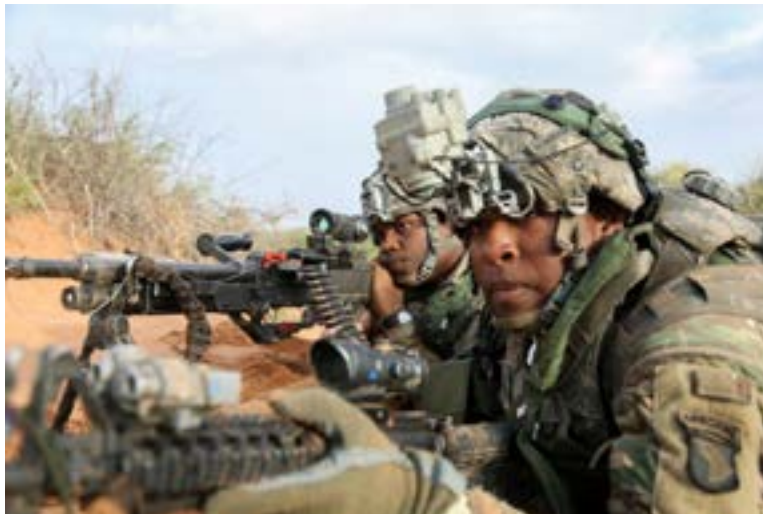
U.S. soldiers assigned to the 1-502nd Infantry Regiment, 2nd Brigade Combat Team, 101st Airborne Division (Air Assault), provide security 15 July 2017 during simulated force-on-force training exercise as part of Network Integration Evaluation (NIE) 17.2 at Fort Bliss, TX. Effective military operational culture that instills a high level of discipline enables an extremely high level of unit cohesion and combat effectiveness.

to define, communicate, inspire, and model to achieve culture change. These descriptors of leadership by personal example are absolutely necessary but do not account for the requirements of organizational- and strategic-level leadership. 11 While direct-level leadership influences individuals, squads, platoons, and companies, it is not effective in leading change in large organizations and institutions where leaders perform leadership not only by example but also through a variety of tools such as leader development programs, policies, training guidance, and the Uniform Code of Military Justice. Any comprehensive approach to culture must take these into account.