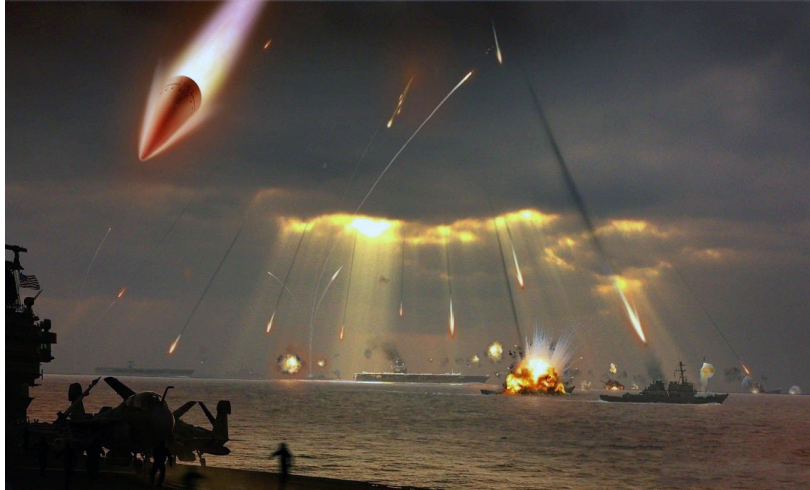
China attacks U.S. Navy fleet in the Pacific.

By and large, our families were holding it together. The soldiers and their families? Not so much. It seemed like half the brigade was stuck in their homes through either a lack of transportation or spouses flat refusing to let them leave. I couldn't blame them. A lot of them were newly married folks in their late teens/early twenties with babies at home. This was their first deployment, march-