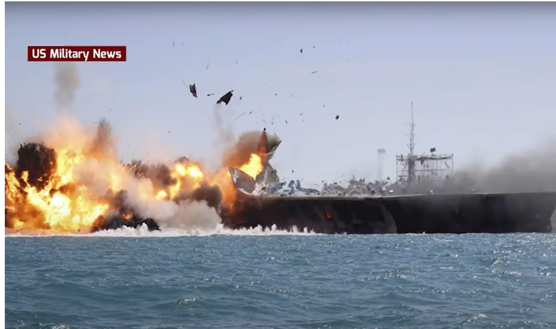
TV broadcast showing Chinese attack against U.S. aircraft carrier.

experienced over the past twenty-four hours was not the main effort. GPS spoofing, cyberattack, and the dis-integration of our air control network has caused several mid-air collisions by both civilian and military aircraft. Casualties are likely to be high, but DHS is having trouble