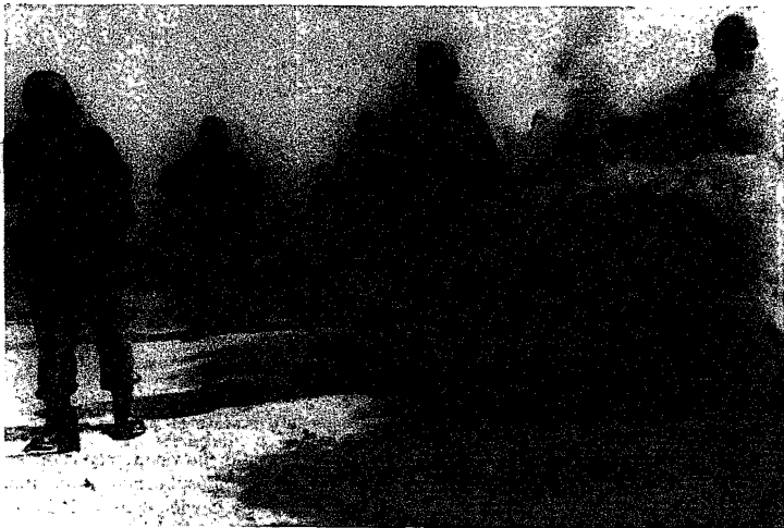
Army News Features

mediate result is a persistent muscular contraction, a state of cramp, followed by paralysis. And this is exactly what happens when the critical esterase, called acetylcholinesterase, becomes inhibited by a G-type phosphorous compound. When the block