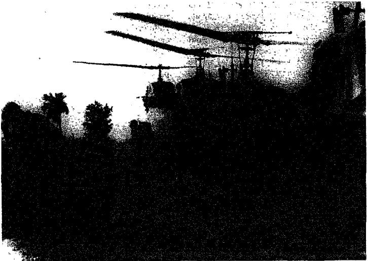
Army News Features