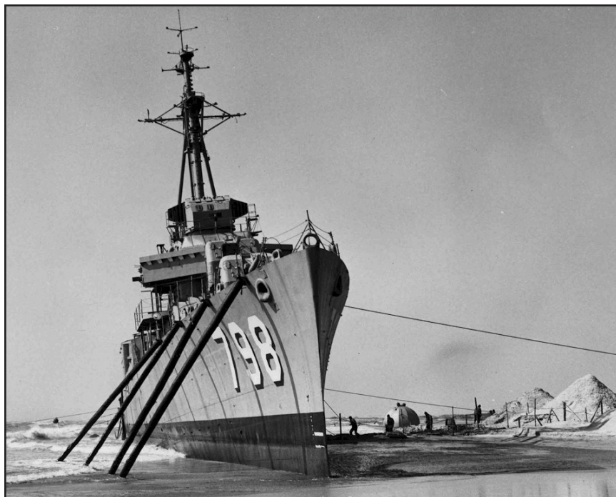
Contaminated fuel destroyed engines throughout the theater and ground U.S. operations to a halt. Trucks, tanks, ships, aircraft, and generators were all rendered inoperable.