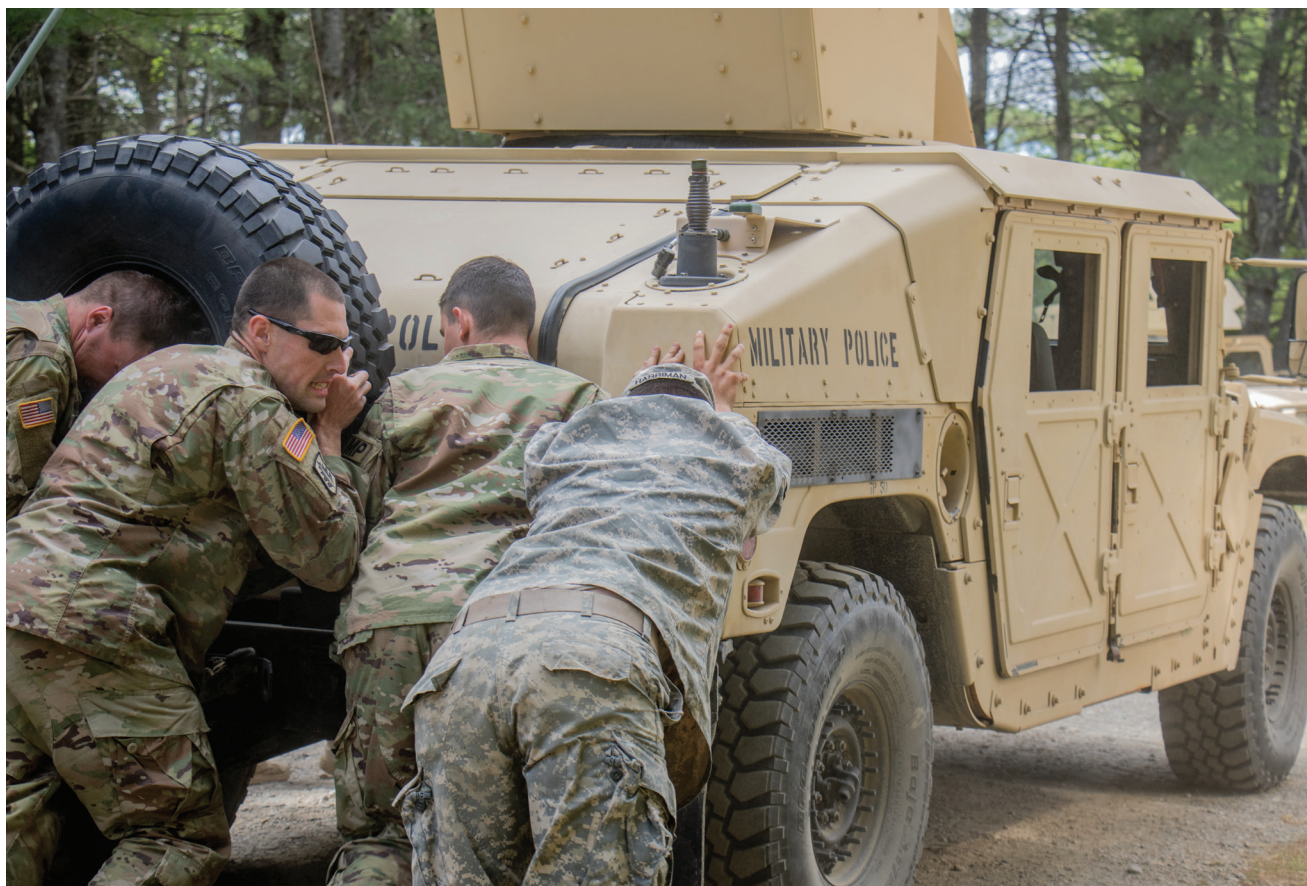
The Division's deployment operations are severely hampered by mounting maintenance issues.

I opened the TC door and climbed in, closing it behind me, pulling on my seatbelt, and strapping on my helmet. Safety first.