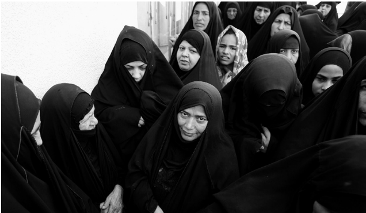
Iraqi widows wait to receive aid distributed by the al-Sadr office in Shula neighborhood of northwestern Baghdad, Iraq, 1 October 2007. The al-Sadr office donated food to victims of sectarian violence.

women in the same way they currently war-game second- and third-order effects.