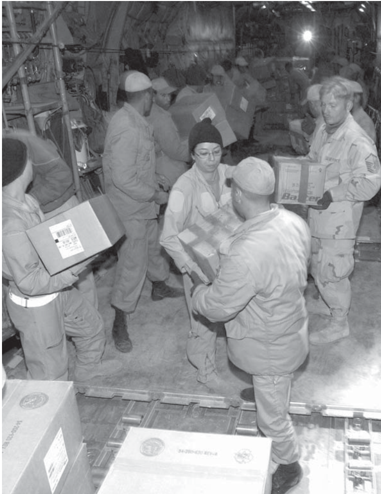
U.S. Air Force C-130 crewmembers and Iranian soldiers offload 20,000 pounds of medical supplies two days after a devastating 2003 earthquake in Iran.