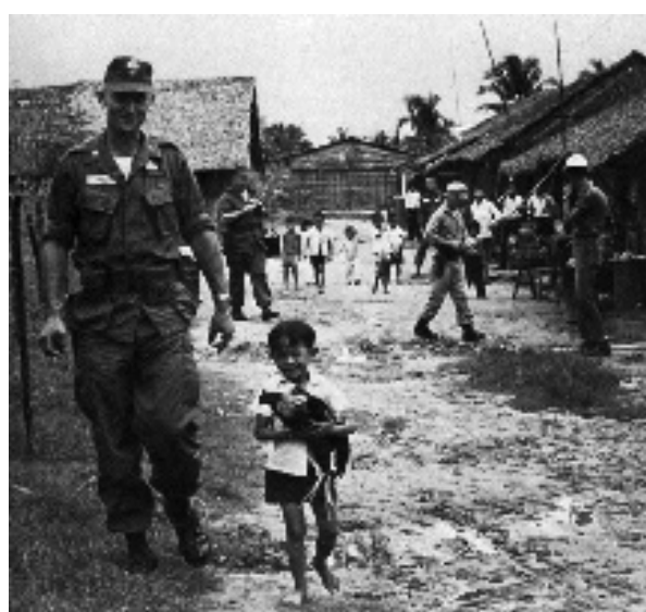
Unidentified U.S. Army adviser and child in the III Corps area north of Saigon, date unknown.

When faced with this sort of dual threat, what is the correct response? Should military planners gear up for a counterinsurgency, or should they fight a war aimed at destroying the enemy main forces? General William C. Westmoreland, the overall commander of U.S. troops under the Military Assistance Command, Vietnam (MACV), faced just such a question. Westmoreland knew very well that South Vietnam faced twin threats, but he believed