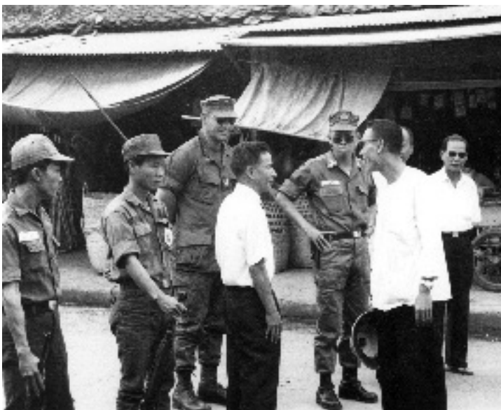
Texas Tech Vietnam Virtual Archive

CORDS’ ability to bring manpower, money, and supplies to the countryside where they were needed was impressive. Some statistics illustrate the point: Between 1966 and 1970, money spent on pacification and economic programs rose from $582 million to $1.5 billion. Advice and aid to the South Vietnamese National Police allowed total police paramilitary strength to climb from 60,000 in 1967 to more than 120,000 in 1971. Aid to the RF/PF grew from a paltry $300,000 per year in 1966 to over $1.5 million annually by 1971, enabling total strength to increase by more than