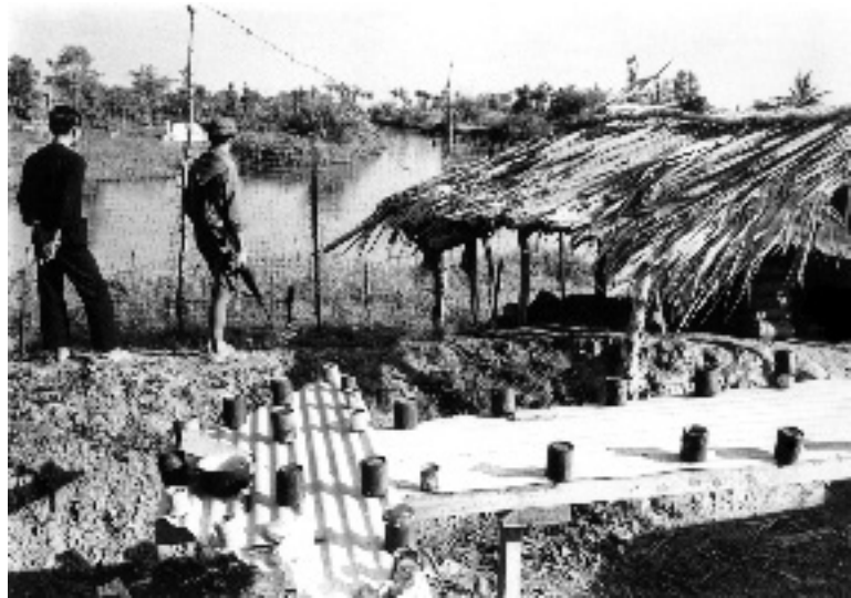
PF platoon on guard in Phu My village, Duip Tuong Province, 1970.

An assassination bureau? Between 1968 and 1972 Phoenix neutralized 81,740 VC, of whom 26,369 were killed. This was a large piece taken out of the VCI, and between 1969 and 1971 the program was quite successful in destroying the VCI in many important areas. 35 However, these statistics have been used to suggest that Phoenix was an assassination program. It was not. People were killed, yes, but statistics show that more than two-thirds of neutralized VC were captured, not killed. Indeed, only by capturing Viet Cong could Phoenix develop the intelligence needed to net additional Viet Cong. Abuses did occur, such as torture, which U.S. advisers could not always halt, but most advisers understood the adage that dead Viet Cong do not tell about live ones.