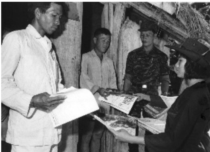
Phung Hoang (Phoenix) Team in field operations, Tay Ninh Province, 1969.

The South Vietnamese Government, on the other hand, was rarely able to keep such a presence in the villages, and when they could, the lack of a permanent armed force at that level meant that officials were usually limited to daytime