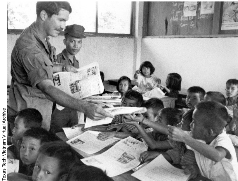
Texas Tech Vietnam Virtual Archive