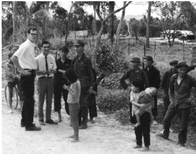
CORDS advisers with hamlet chief in Binh Dinh Province, 1969.

Counterinsurgency, or pacification as it was more commonly known in Vietnam, was forced to deal with the twin threats of enemy main forces and a constant guerrilla presence in the rural areas. MACV campaign plans for the first 2 years of the war show that pacification was as important as military operations, but battlefield realities forced