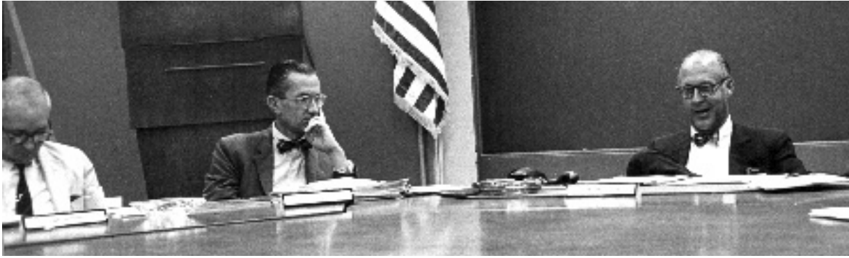
Texas Tech Vietnam Virtual Archive