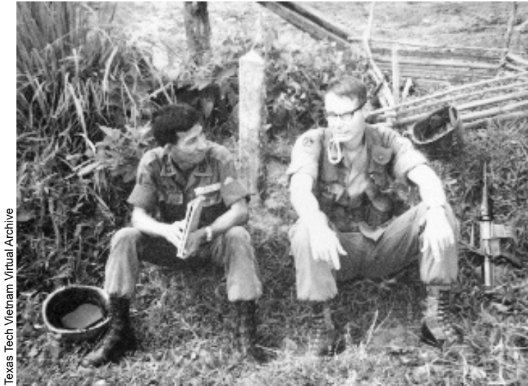
Texas Tech Vietnam Virtual Archive