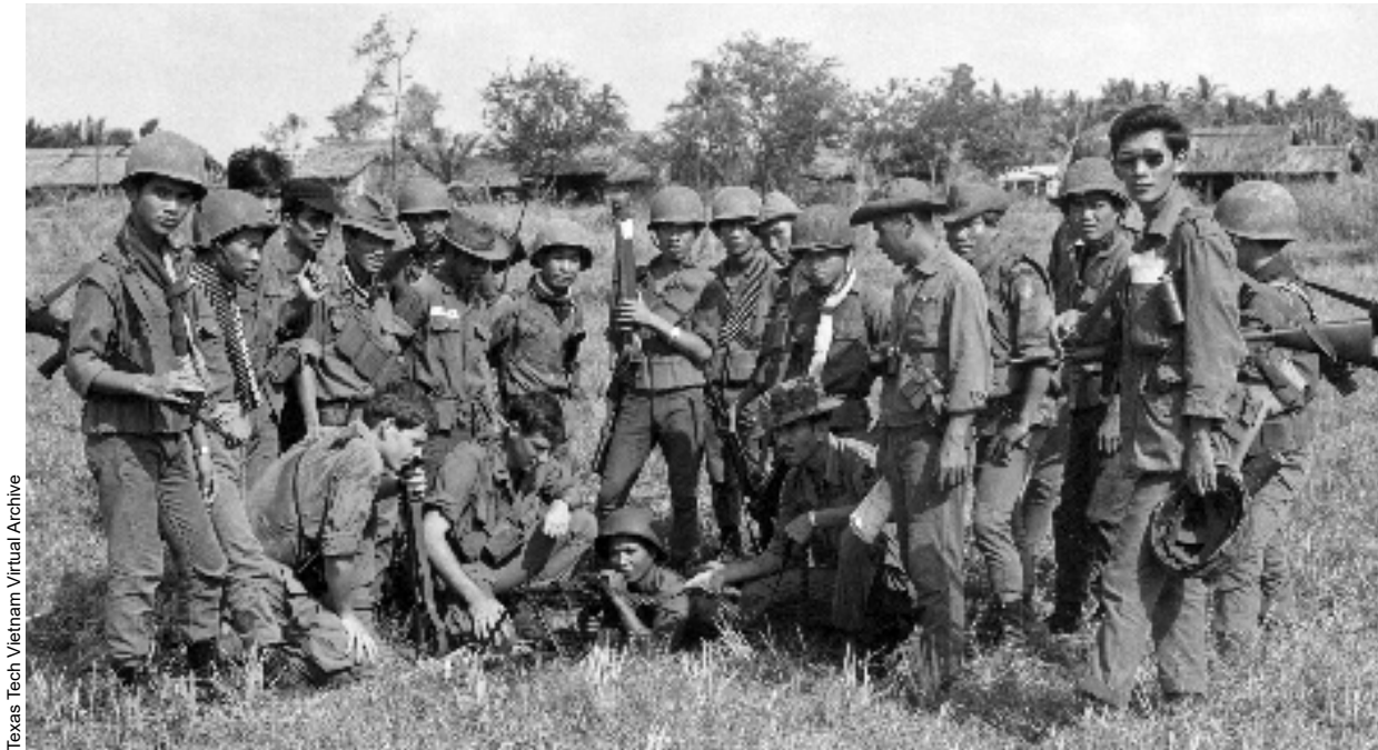
Texas Tech Vietnam Virtual Archive