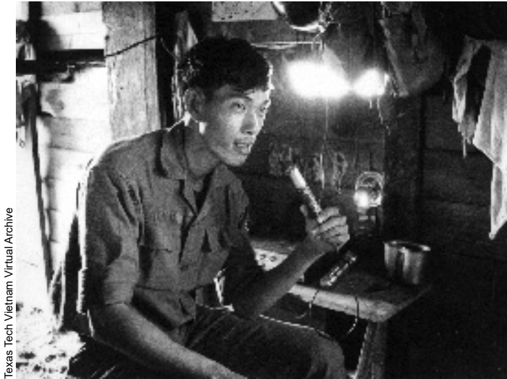
Texas Tech Vietnam Virtual Archive