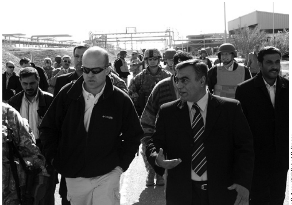
The author (in sunglasses) discusses operational details with the director of plant operations during a tour of a fertilizer plant in Bayji, Iraq, 28 February 2007.

To date, six factories have restored production operations. These factories include major industrial operations in Iskandariyah, a town thirty miles south of Baghdad on the "fault-line" of the Sunni-Shi'a sectarian divide and a hotbed of insurgent sympathies resulting from economic depression. In Najaf, a large, modern clothing factory has been restarted, restoring employment to over 1800 employees. Over 70 percent of these employees are women, including supervisors and engineering staff. The six factories represent only a small beginning. With modest sufficient funding, the task force believes it can restart dozens of factories in calendar year 2007, restoring employment to tens of thousands of Iraqis and creating significant economic uplift in wide areas of the country.