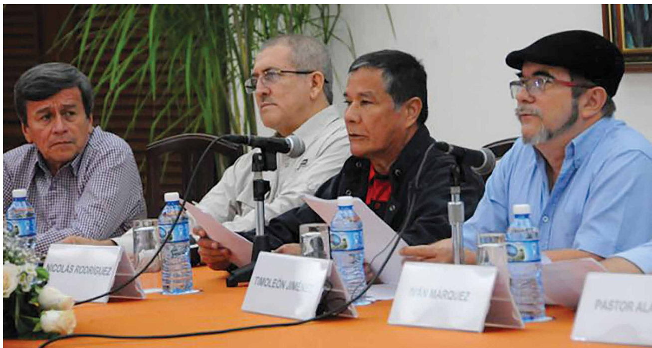
In 2017, National Liberation Army (ELN) leaders Pablo Beltrán, Antonio García, and Nicolás Rodríguez meet with demobilized Revolutionary Armed Forces of Colombia (FARC) leader Timoleón Jiménez in Havana.

cooperation to open incorporation into the overall Bolivarian project. 17