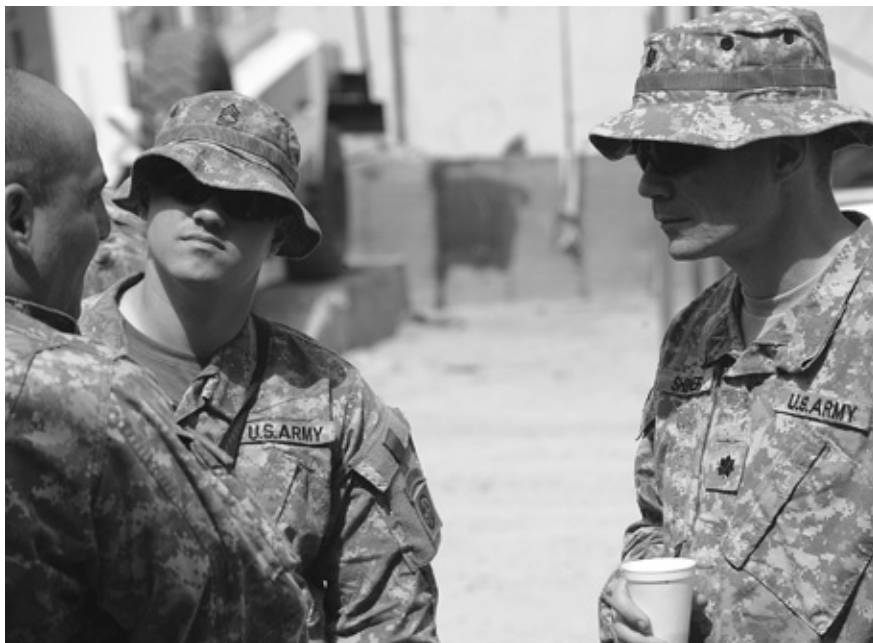
Soldiers from the Public Affairs Office listen to an NCO at Joint Security Station Zafaraniya, eastern Baghdad, Iraq, 18 April 2009.

Therefore, commanders and command sergeants major at all levels should challenge each other and challenge their Soldiers to help change our culture. This is not resource-intensive. We can and should make subjects such as honesty and integrity a common part of the conversation in motor pools, forward operating bases, training areas, orderly rooms, and athletic fields. We should talk