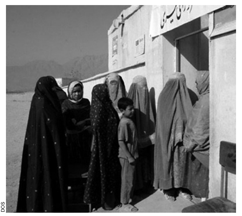
Afghan women line up outside a voting place during the successful parliamentary and provincial elections held on 18 September 2005.

Decisions made by military units at the tactical level can often impact the strategic foreign policy goals of the U.S. Government. This tendency has been amply demonstrated in Afghanistan and Iraq. Aware of the government's policy priorities, a deployed DOS employee can provide increased direction to a unit as it confronts political, diplomatic, and civil-affairs problems. His guidance and input can be especially useful and important because the quick pace of military operations, especially during combat, often requires on-thespot decisions that a U.S. embassy would be slow to make. Absent an embassy's presence, such as in Iraq and Afghanistan at the beginning of Operation Iragi Freedom and Operation Enduring Freedom respectively, formal embassy decisions would be impossible to obtain. Because the DOS employee would be aware of the situation on the ground, this would also immeasurably improve the situational