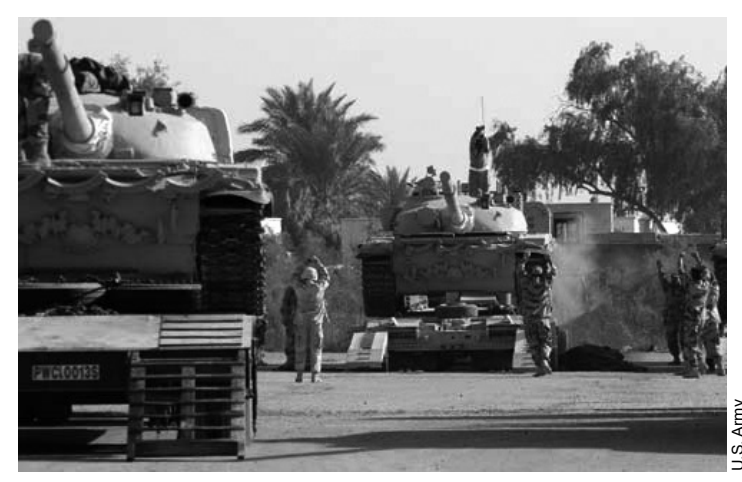
Iraqi soldiers, with help from Coalition advisers, spent three days offloading 77 T-72 tanks, which will equip the 2d Brigade.

Accordingly, at the tactical level, officers and soldiers from the old army are inclined to try to solve