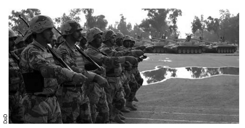
Iraqi soldiers march by the reviewing stand at Taji Military Base in a ceremony celebrating the largest NATO-driven equipment donation to date (17 November 2005).

the IAG nor the Iraqi unit have a formal command relationship with the partner unit. Iraqi units have their own chain of command, and are not part of the Coalition.