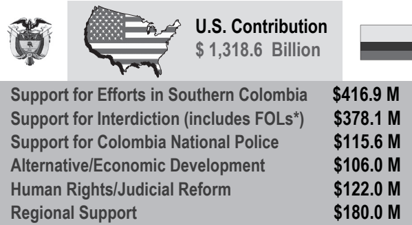
Table 1. U.S. Allocations for Plan Colombia .

The profound institutional and strategic shifts outlined above occurred as the United States, in the aftermath of 9-11, altered the approach of the Clinton years (1992-2000) and dropped the artificial barrier that had separated counter-narcotics (CN) from COIN. This was critical because, during the Clinton administrations, the war had been artificially divided in accordance with the demands of American domestic politics. Washington was compelled to focus upon CN to the virtual exclusion