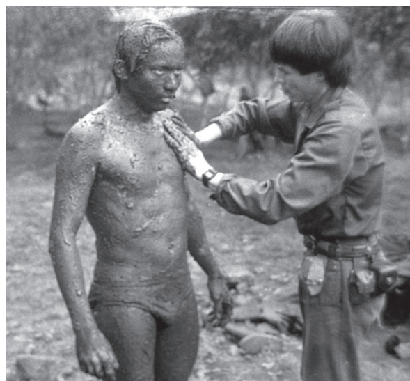
In this captured photo, a FARC sapper applies natural camouflage. FARC sappers have in the past been trained by Vietnamese, Cuban, and FMLN operators. They specialize in infiltration attacks.

Thus, Colombia's COIN approach during the Pastrana years was not the result of deliberation and consultation within the government, but of an uneasy, unstated compromise, as Pastrana and his intimates negotiated with a duplicitous insurgent leadership on one hand, while on the other, they confronted the security force's growing unwillingness to accept the administration's increasingly discredited strategic calculus. When, in the face of all evidence to the contrary, Pastrana attempted to push through a second Zona , this one for the ELN, he faced a virtual popular revolt in the designated area. Cutting his losses prior to the first round of that year's presidential elections, Pastrana ordered the military in February 2002 to reoccupy the original Zona .