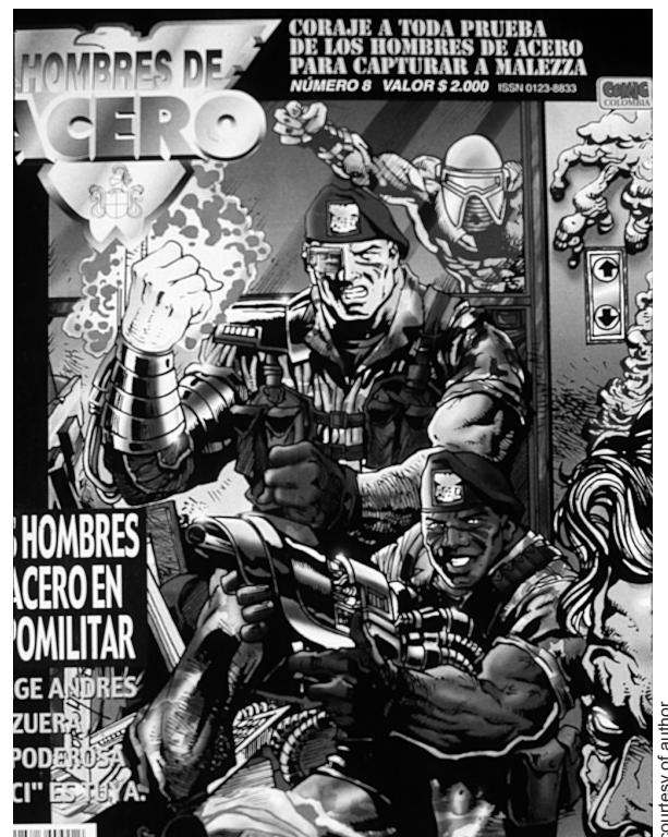
Democratic Security covers all bases: comic books, cartoon shows, a website, school appearances, and other psyop products have been deployed to win over Colombia's newest generation.

In only one way can FARC's tactical actions have strategic or even operational significance: if they can be parlayed into political consequence.