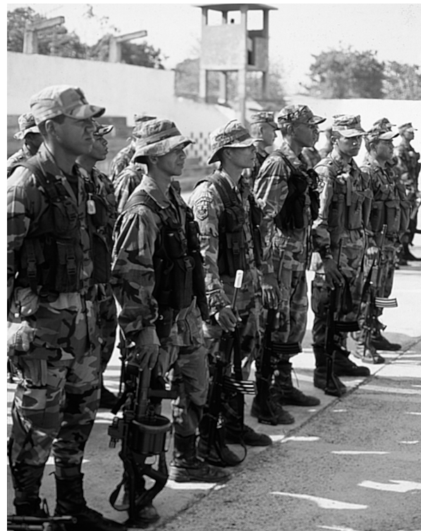
A local-forces platoon, part of the Home Guard that has been key to Colombia’s successful COIN approach, prepares for an inspection prior to a mission.

divisions. Altogether, the volunteer units amounted to 47 counter guerrilla battalions ( batallones contraguerrillas , or BCG) and 3 mobile brigades ( brigades moviles , or BRIM) each comprised of 4 BCG, for a total of approximately 59 BCG (each with approximately 40 percent of the manning of a line battalion, but with additional machine guns