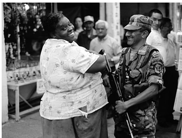
A soldier on patrol takes a moment to chat with a passerby. Although Colombia's forces face unrelenting attacks from international rights organizations, the military is one of the country's most popular institutions.

Hence, as concerned the security forces, the strategic and operational threat had remained relatively constant in nature, regardless of increasing insurgent (especially FARC) involvement in the drug trade and other criminal activity. The insurgents