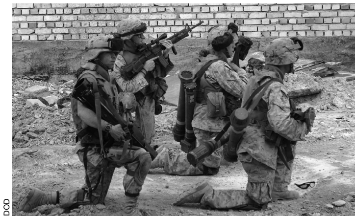
Marines from Charlie Company, 3d Battalion, Regimental Combat Team 7, provide security while a mortar team fires on enemy positions during Operation Al-Fajr, 12 November 2004.

Using this intent as a guideline, MNF-I, MNC-I, and Multi-National Force-West (MNF-W) developed courses of action to mass effects in the information domain, thereby raising the IO threshold and creating additional "maneuver" room for combat operations in Fallujah. We deliberately countered enemy information campaigning, planned and executed IO shaping operations, and executed carefully planned senior leader engagements, military diplomacy, and public diplomacy activities. As a result of these synchronized, integrated, and complementary actions, we were able to mass information effects and build a strong base of support for combat operations in advance of the operation; in other words, we were able to raise the IO