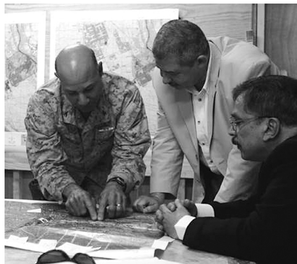
MNC-I and Iraqi government officials discuss security plans associated with the January 2005 elections.

The Green Cell had matured over the 8 years since the Division XXI AWE, and, although its formal objective for 1st Cav's BCTP Warfighter was to drive IO, it spent little time in the 5 disciplines of our doctrinal IO. It did, however, spend very important time in helping Division Headquarters prepare for the perception of a war it might face in Iraq—regretfully by being reactive instead of proactive.