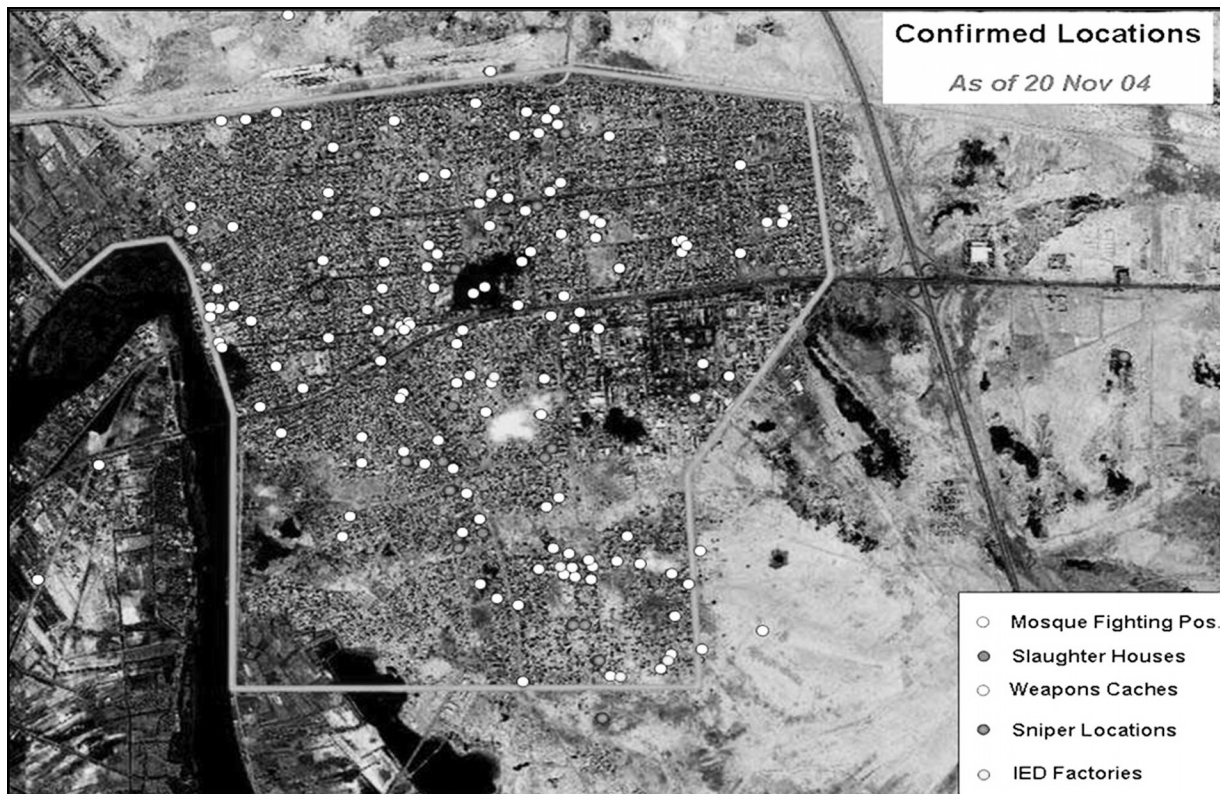
Figure 1. Operation Al-Fajr—Fallujah, insurgent activities map.