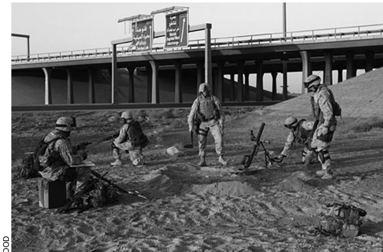
U.S. Marines of Weapons Platoon, Company E, 2d Battalion, 1st Marine Regiment, dig in while they wait to go in and patrol the city of Fallujah, Iraq, during Operation Vigilant Resolve.

relentless, and technologically savvy foe who recognizes that the global information network is his most effective tool for attacking what he perceives to be our center of gravity: public opinion, both domestic and international. And the truth of the matter is that our enemy is better at integrating information-based operations, primarily through mass media, into his operations than we are. In some respects, we seem tied to our legacy doctrine and less than completely resolved to cope with the benefits and challenges of information globalization. We are too wedded to procedures that are anchored in the Cold War-Industrial Age.