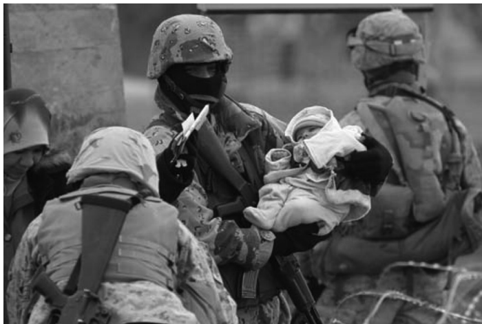
Iraqi soldiers help carry a baby through a checkpoint during the January 2005 elections.

In reality, these two vignettes (Al-Fajr and the embassy attack) are clear examples of how we can