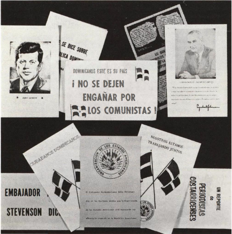
A wide variety of leaflet appeals supported the aims of the US and the Organization of American States, and informed the populace of the true situation they faced

the necessity for fast-moving response, contributed its resources to the fullest to meet the national requirement. Equipment, talent, logistic resources, and personnel were pooled