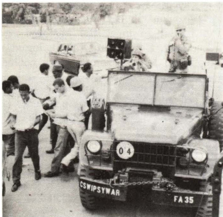
Crowds seeking information collected rapidly at each stop of the loudspeaker and leaflet trucks

Using the antenna of a destroyed transmitter, the Army mobile radio broadcast station came on the air only 60 hours following the decision to move from Fort Bragg to the Dominican Republic