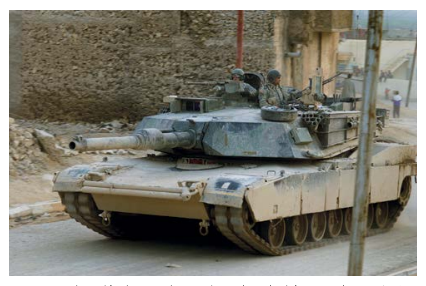
A U.S. Army M1 Abrams tank from the 1st Armored Division conducts a combat patrol in Tal Afar, Iraq, on 27 February 2005.

to situations like those found in Tal Afar. This key vulnerability stems from a typically American overeagerness to make friends in the local community and to quickly establish a cooperative working relationship with locals. U.S. units initially engaged with anyone calling himself a sheik. Unfortunately, it now appears that they were frequently duped by persons who took advantage of U.S. ignorance of the Turkoman commu-