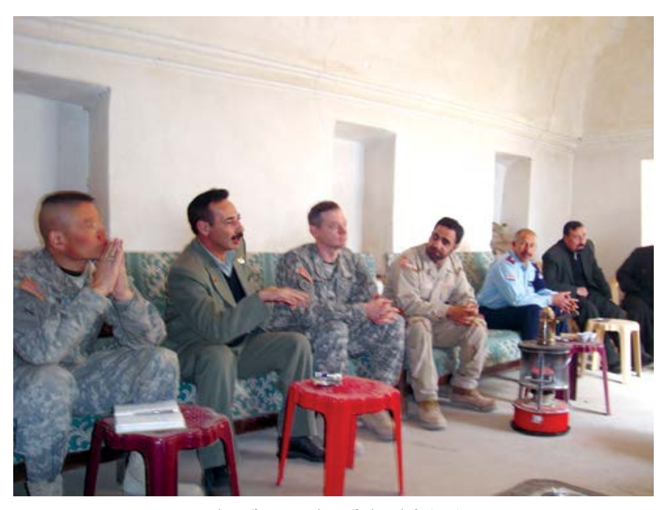
Military officers meet with city officials in Tal Afar.

considering the impact such intercourse might have on the entire local situation, these acts were interpreted as favoritism aimed at undermining the prestige and authority of other, traditionally dominant, tribal groups. As a result, we angered and alienated groups that could have acted as key agents in working with the coalition to stop insurgent elements and establish stability in the community.