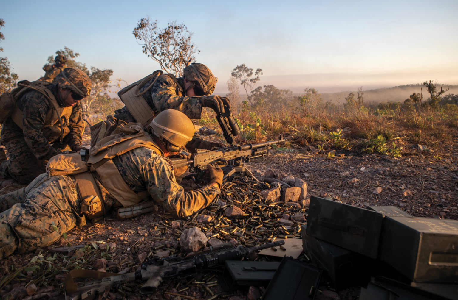
Marines with Weapons Company, 1st Battalion, 7th Marine Regiment (Reinforced), Marine Rotational Force–Darwin, check the feed tray of an M240B machine gun on a support-to-ground-maneuvers range 23 June 2021 during Exercise Southern Jackaroo at Mount Bunday Training Area, Australia. Marines, Australian Army soldiers, and Japan Ground Self-Defense Force soldiers exercised their combined ability to provide mounted and dismounted support to trilateral maneuver elements utilizing direct and indirect fire support weapons. Defense ties between the United States, allies, and partner nations are critical to regional security, cooperation, and integration of our combined capabilities.

to competition on favorable terms.” 1 In order to penetrate A2/AD systems, Field Manual (FM) 3-0, Operations , explains that the Army will exploit weak points and seize positions of relative advantage through maneuver warfare. 2