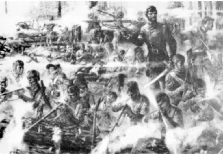
Museum of Florida History, Tallahassee, Florida

During the Second Seminole War, Major Francis L. Dade and all but three soldiers of his 110-man detachment were killed on 28 December 1835 during an ambush near Ocala, Florida.