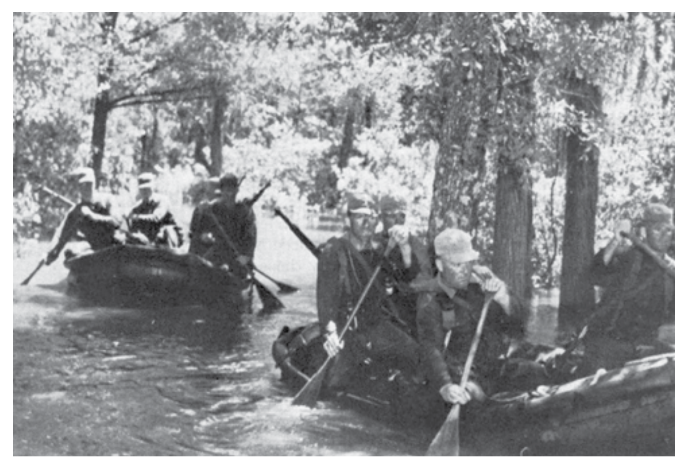
Emphasis is now given to unconventional warfare capabilities.

is unrealistic, and probably undesirable, to make their own cultures into mirror images of Western societies.