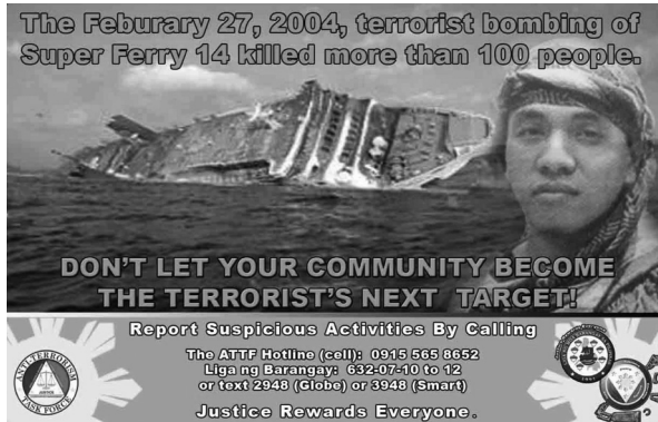
Figure 3. AFP/U.S. public information product

The JSOTF has increasingly emphasized information operations that heighten public awareness of the negative effects of terrorism and provide ways to report terrorists to local security forces. Also featured are positive actions the government and military take to foster peace and development. The introduction of a Military