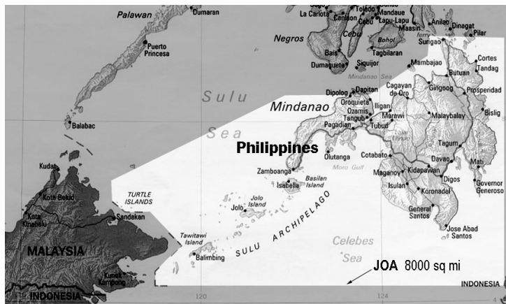
Southern Philippines— Joint Operations Area