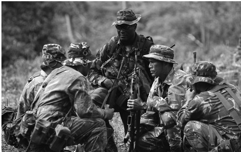
A U. S. Army Special Forces Soldier conducts security assistance training for members of the Philippine Armed Forces on the Zamboanga Peninsula, 20 March 2003.

The “Basilan Model” and follow-on U.S. efforts offer a template for a sustainable, low-visibility approach to supporting America’s allies in the GWOT. In Iraq, where unilateral conventional operations have often been ineffective and even counterproductive, we should consider employing SF advisory teams on a large scale. Because they know the geography, language, and culture of the region and are skilled in working “by, with, and through” indigenous forces, SF is uniquely suited to adeptly navigate Iraq’s politically and culturally sensitive terrain to enable effective host-nation