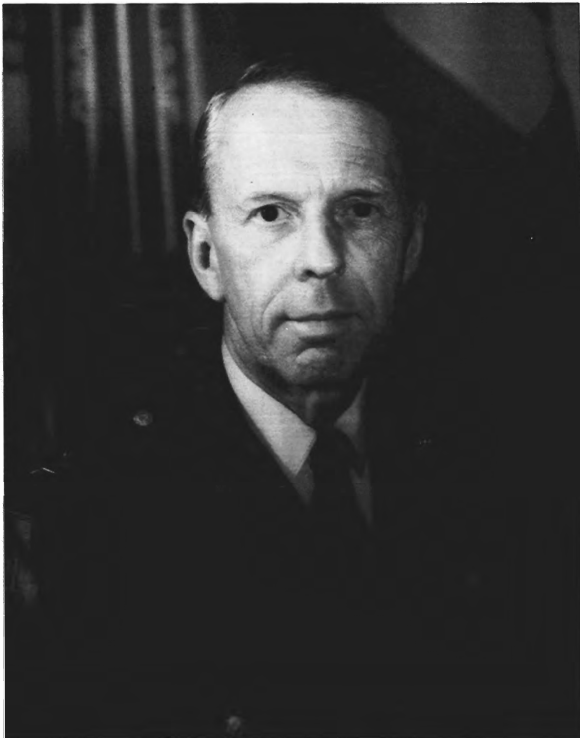
General William E. DePuy