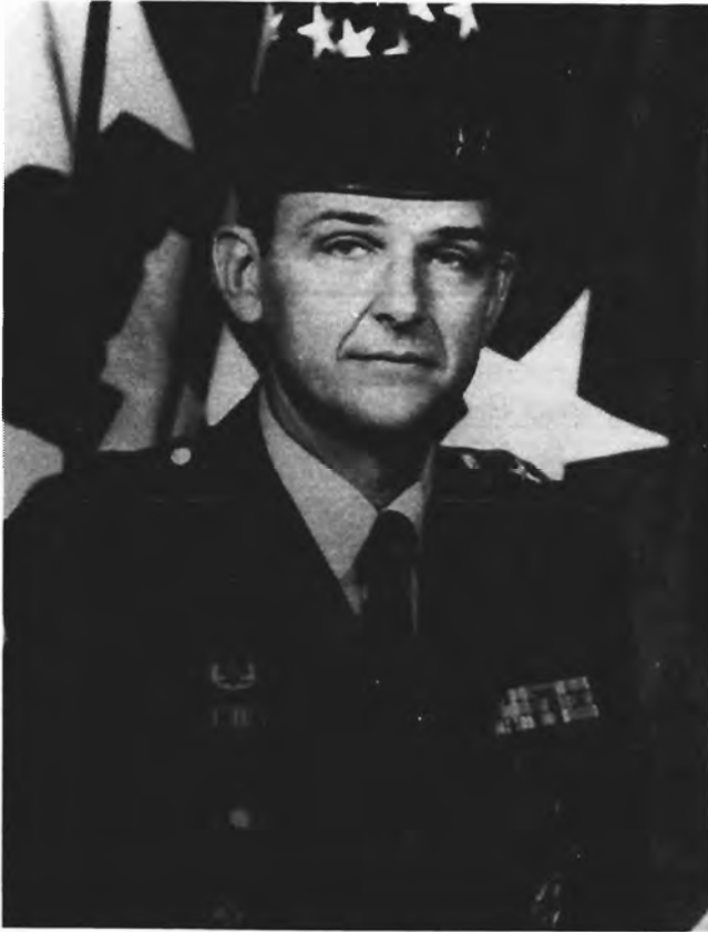
Major General (later General) Donn A. Starry

of a field commander employing his force as he sees fit. When a field commander prescribes his unit's training and war plans, he has ultimate authority over its tactical doctrine. Therefore, without the field commanders' active collaboration in the doctrinal reform process, they would not feel obligated to adhere to doctrine developed only by TRADOC. "It will not suffice to simply send our training circulars out and trust that they will be acclaimed on the basis of their eminent logic," Starry warned his boss after a visit to Europe in April 1974. "Groundwork must be laid, it must begin in the chain of command; like everything else, one has to talk about an idea persuasively for a while before it has any chance of being accepted." Starry left no doubt as to the importance of this persuasive effort: "I am fearful that we won't make the headway we hope for . . . unless a very carefully thought out preparatory dialogue is set up with commanders all over the world." 11