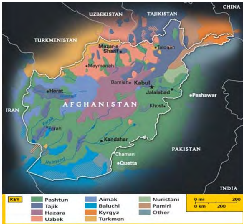
Figure 1. Central Asia Languages