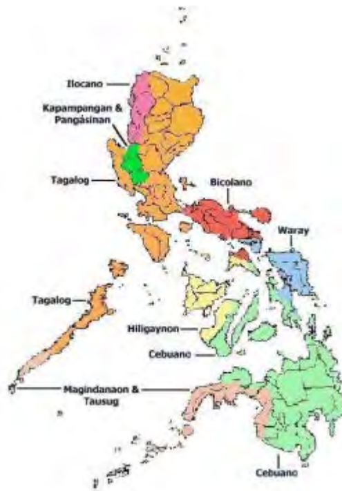
Figure 2. Southeast Asia Languages