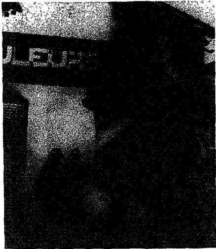
Paint works destroyed by a bomb 14 January 1957

FLN . Opposing this formidable force were scarcely 1000 municipal police, equipped only to combat common criminals in time of peace. 3 Taken by surprise by an adversary of which it was totally ignorant, the police were incapable of dealing with the situation. As the plight of Algiers worsened, the French Government was forced into a difficult decision: