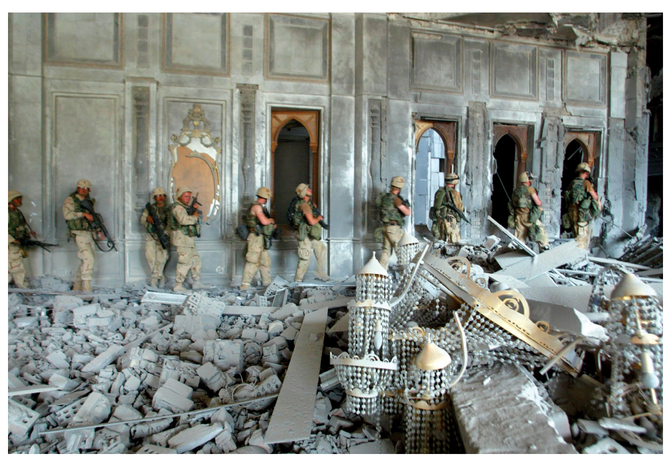
Soldiers from Company A, 3rd Battalion, 7th Infantry Regiment, search one of the presidential palaces 8 April 2003 in Baghdad. The palace was the second that the U.S. Army had secured in as many days; both lavish buildings were heavily damaged by U.S. Air Force bombing.

Baghdad, reestablish order, and prepare for the next combat operation (Phase V, Consolidate Gains).<sup>39</sup> In a seven-day urban battle, two U.S. divisions dislocated Hussein's regime from Baghdad and rendered the Iraqi regular military irrelevant. 3rd ID exploited the "Thunder Run" penetrations and made it clear to Hussein's regime, the Iraqi people, and international audiences that American forces controlled Baghdad and had won the LSCO phase of the war.<sup>40</sup> Hussein was not captured, however, and his regime never