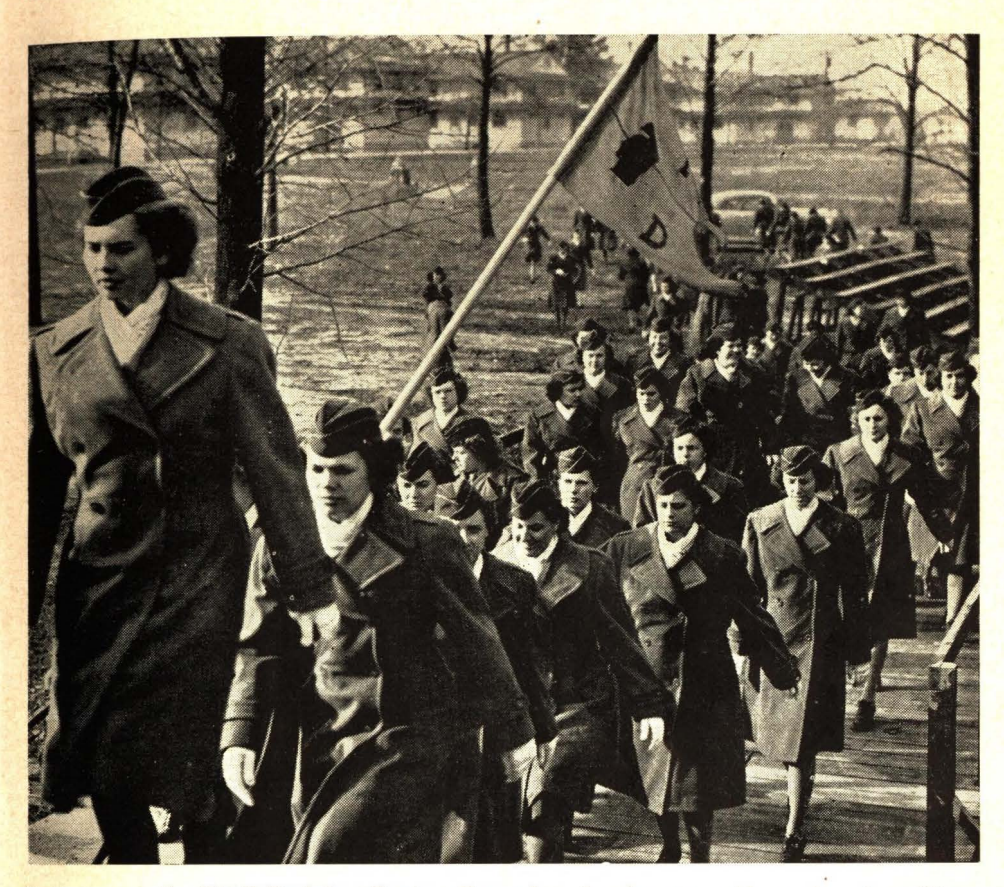
Trainees at the WAC Training Center, Camp Lee, leaving an outdoor class in military etiquette and customs of the service, a part of their basic training course.

of women by the Armed Services in the future. For the military has discovered what business and industry have long known—that the efficiency of any organization may be improved by the utilization