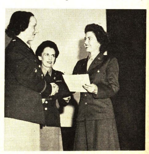
Two recruits for the new Regular Army WAC (left) report at the WAC Training Center at Camp Lee. After completion of 8 weeks training, a WAC recruit receives a certificate (right).

gaping chasm where once bridges arched. Everywhere they have served they have learned to know the people with whom they have worked, or among whom they have lived. They have met and talked to the English, the Dutch, the French, the Belgians, the Germans, the Filipinos, the Chinese, the Japanese, the native islanders of New Guinea. They have found that the problems of living are essentially the same the world over. They have gained not only a respect for the people of other countries, but a deeper respect