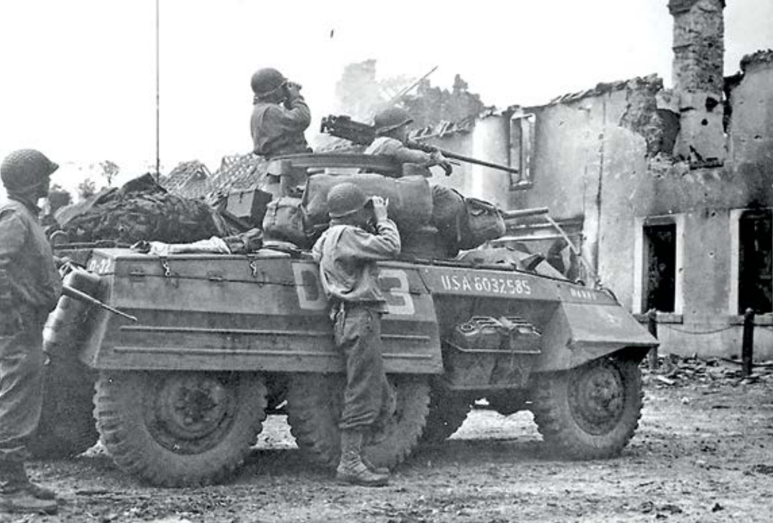
An M8 Light Armored Car is used to conduct reconnaissance during World War II circa 1944. The M8, sometimes referred to as the Greyhound, was provided to cavalry units as a reconnaissance vehicle. It could travel at speeds of 55 mph and had excellent on-road mobility, which made it especially useful for operations on the well-developed road systems of Europe. It was equipped with a long-range radio and was armed with a 37 mm gun and either a .30-caliber or .50-caliber machine gun. The M8 proved very versatile and was widely used by cavalry units for reconnaissance and to support screening missions both during World War II and for decades after the war.