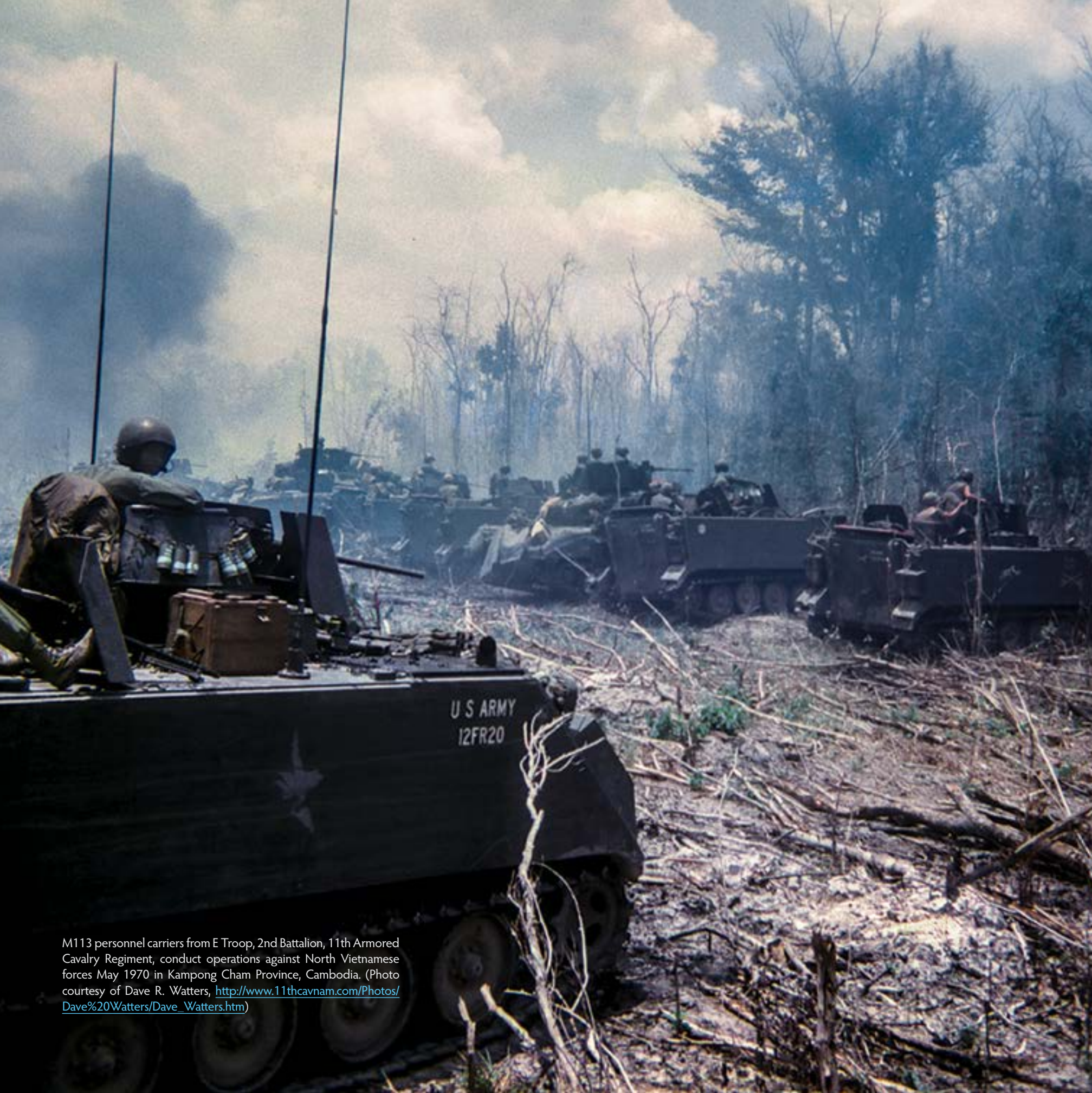
M113 personnel carriers from E Troop, 2nd Battalion, 11th Armored Cavalry Regiment, conduct operations against North Vietnamese forces May 1970 in Kampong Cham Province, Cambodia.

vehicles and light tanks, the armored divisions each owned a mechanized squadron and the infantry divisions owned a motorized reconnaissance troop. The MCG in particular provided senior tactical commanders with a modular “pool” of reconnaissance forces that could operate while consolidated or dispersed to empower main efforts. Throughout the conflict, the Army deployed thirteen MCGs and sixteen divisional squadrons to Europe. 6