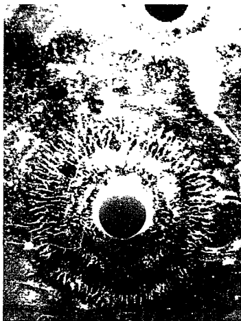
Liquid crystals (blood)

were successful, others were not, leading to the conclusion that an extremely complex phenomenon was involved. 10