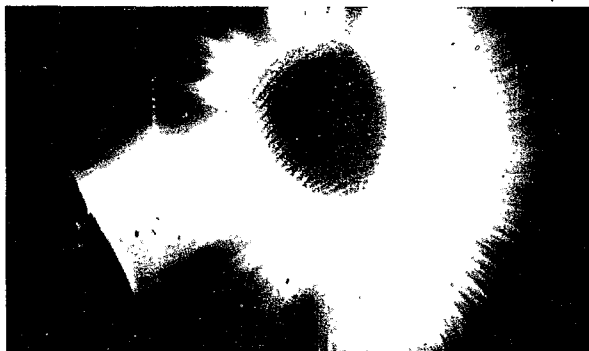
Interaction between fingertip and magnet (lower left)

itary application is evident. They continue to fund this program and operate research centers such as those at Novosibirsk. If there were no perceived military advantages, it is doubtful they would provide financial and scientific backing.