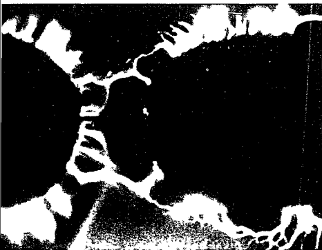
Two persons (attraction)

• Telepathic behavior modification, which includes the ability to induce hypnotic states up to distances in excess of 1,000 kilometers, has been reported. 7