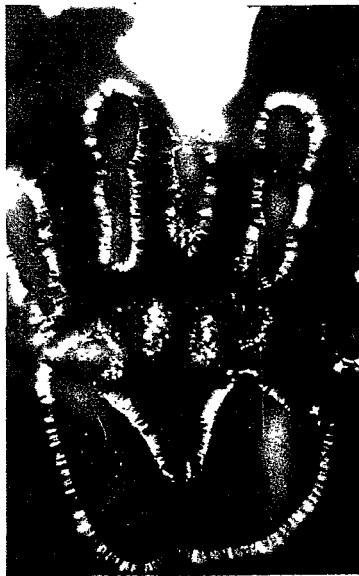
Hand of "healer" sending energy