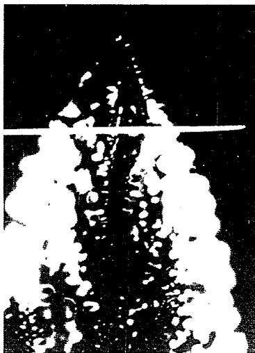
Leaf has been cut where white line is. Everything above the white line is invisible to the eye.

innate skills of controlled OOB, and data reliability is uncertain. These problems can be attributed to lack of observation skills of the subject as well as the complexity of the phenomena involved.