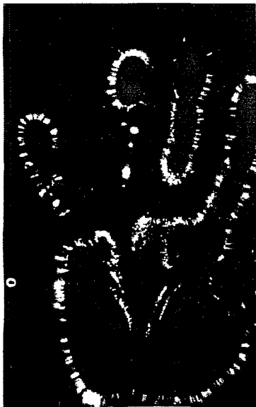
Hand of "healer" at rest

Two major problems presently exist in the implementation of this program: Only certain individuals have demonstrated