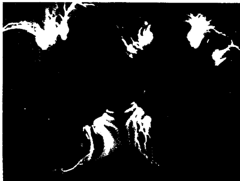
Two persons (repulsion)

Scientific experimentation has also been conducted with OOB. Test subjects have induced OOB states while being physiologically monitored and have retrieved data that was not available through normal means. Experiments frequently include identification of random numbers either placed out of sight nearby or at a more distant location. A distinct electroencephalogram (EEG) pattern called Alphoid has been isolated during tests, thereby indicating that this state is detectable through accepted physiological monitoring methods. Although some tests