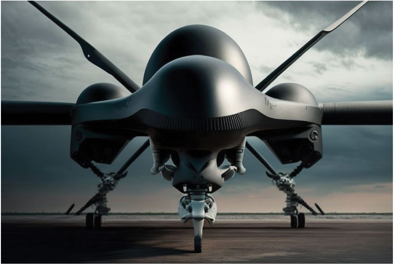
Concept for an autonomous AI augmented drone (AI image generated by Charlotte Richter, Military Review )

logistics burden, and by the ability to tailor weapons effects depending on mission requirements. New energetic materials with increased yield and more flexible applications are required.