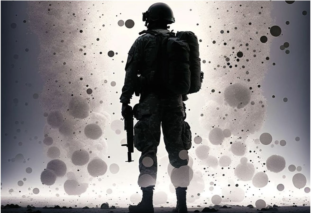
A soldier stands amid aluminum particulate clouds.