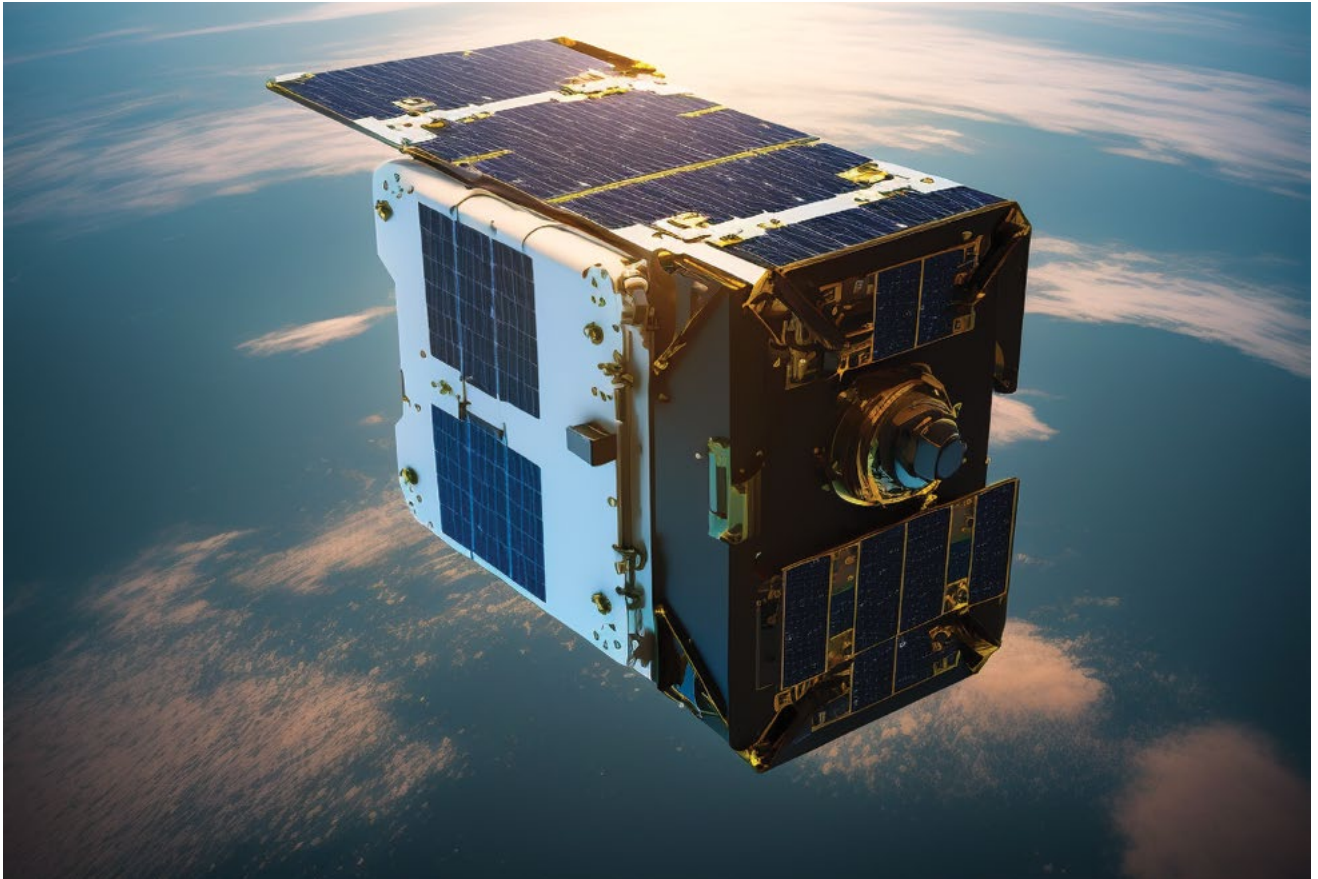
Concept for a nanosatellite (AI image generated by Charlotte Richter, Military Review )

one thousand million million operations) for solving linear systems of equations to 148.6 petaflops in the summit supercomputing machine at the Department of Energy's Oak Ridge National Laboratory. 19