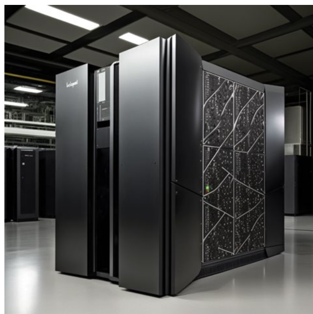
A supercomputer concept (AI image generated by Charlotte Richter, Military Review )

extrapolation into the realm of AI M&S and its potential for designing new molecules remain relatively unrealized. 25 Previous research on the intersection of AI and M&S underscores how the latter, with its inherent problems and challenges, may benefit from AI concepts and techniques. 26 Simulation has been used to develop AI applications including how AI components can be inserted into a simulation to establish machine learning or adaptive behaviors, key aspects in determining structure-function relationships at the molecular level. Simulation is now recognized as having the ability to evaluate the impact of incorporating AI into real world systems such as manufacturing processes. 27 Another innovative opportunity in M&S is the application of AI for production process optimization and calibration. 28