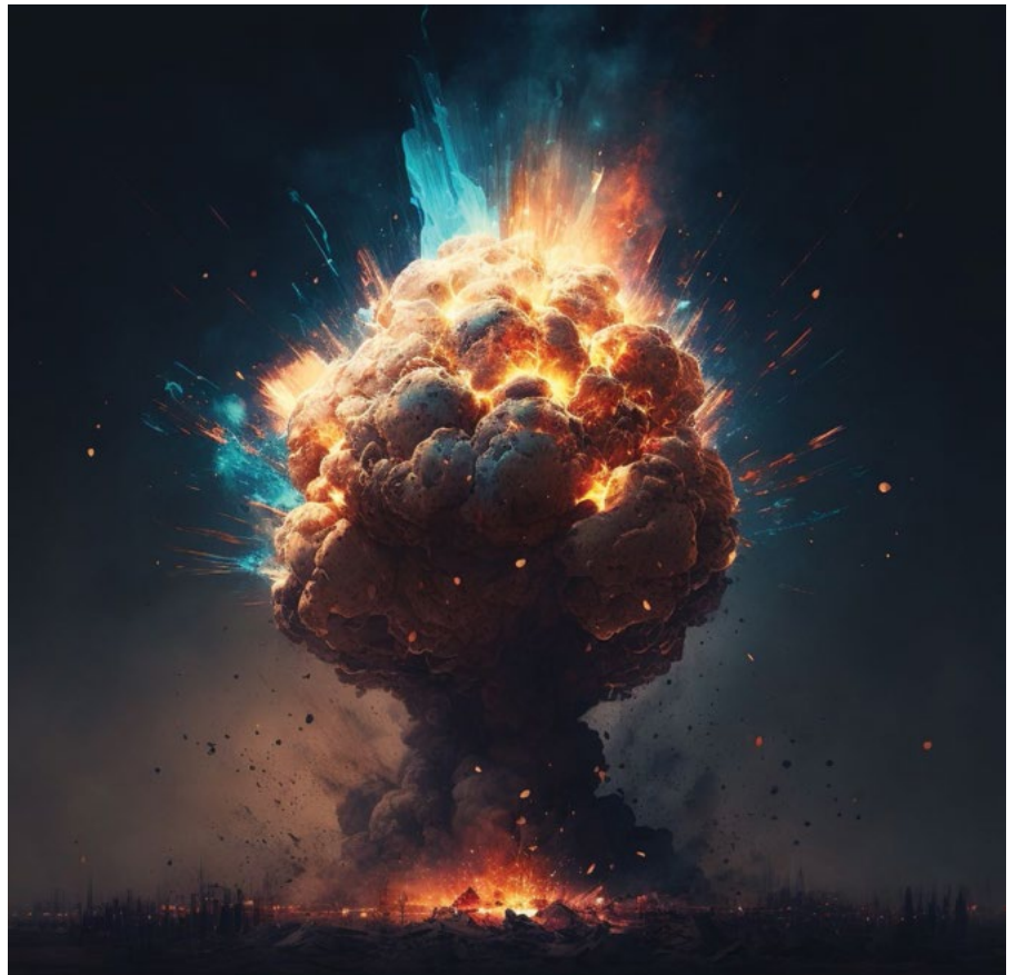
“Adding metal particles, particularly aluminum, to pyrotechnics, explosives, and propellants is known to increase the energetic output.” (AI image generated by Charlotte Richter, Military Review )

Supercomputing platforms are facilitating first-principles-based simulations to predict behavior of complex systems never previously achieved. 17 These simulations