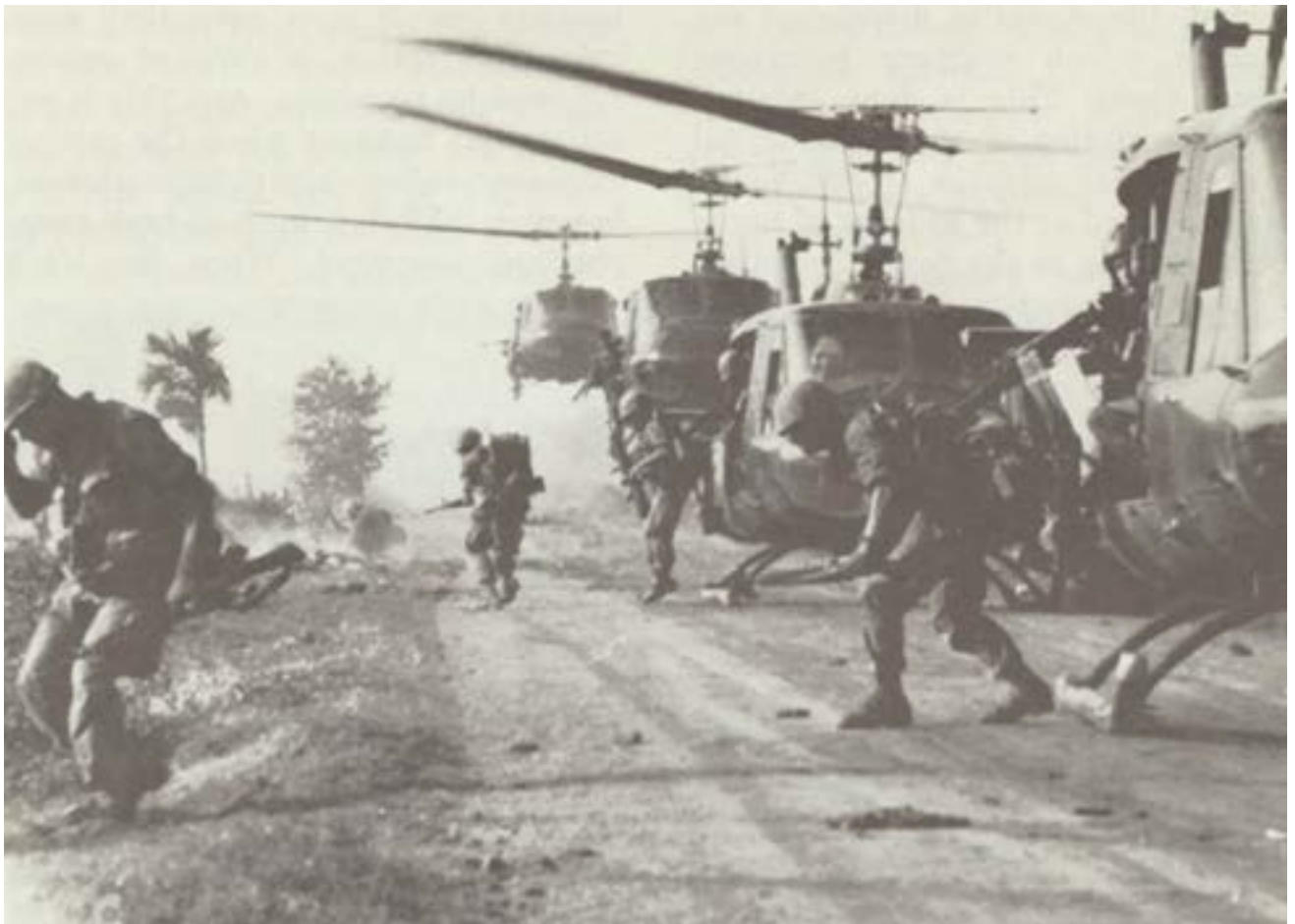
Enzyme inhibitors could turn these troops into a state of paralysis.

The therapeutic effect aimed at should vanish with the need for relaxation, but in some patients suxamethonium caused unexpectedly long lam- ing of muscles and dangerous standstill of respi- ration. While curare was, at an earlier stage of its medical use, the carefully guarded secret of tribal witch doctors, nothing in that way entered modern