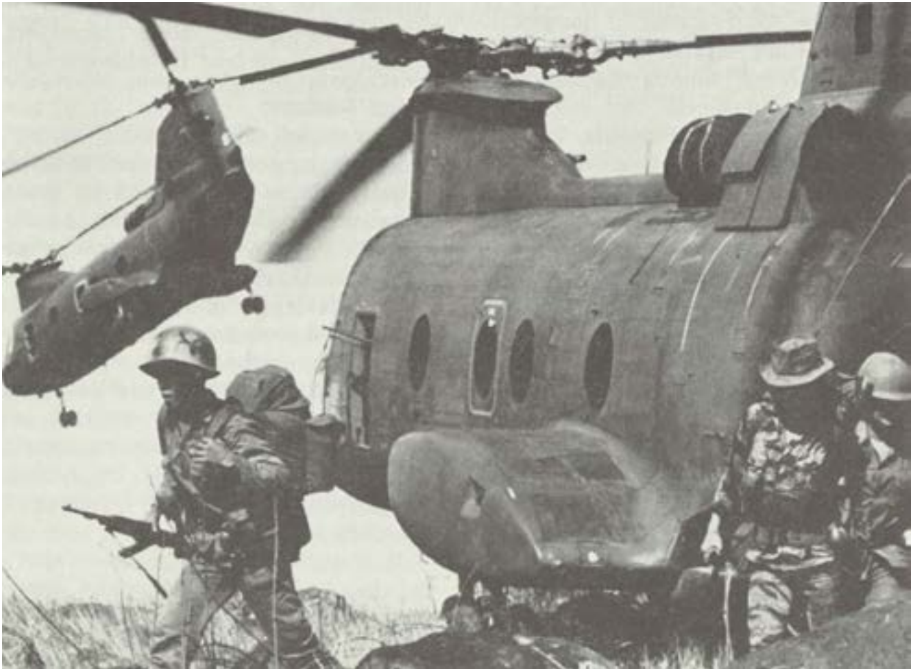
Innate differences in vulnerability to chemical agents between different populations have led to the possible development of ethnic weapons. (Vertol Division - The Boeing Company)