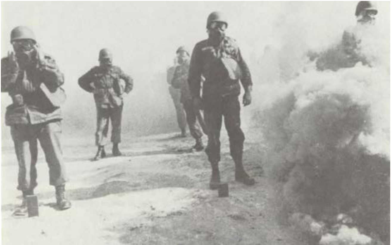
Face masks provide protection from a variety of agents, but a minute droplet of VE or VX passing rapidly through the skin can be fatal.

anesthesiology. The relaxant was right; the patient was unfit. The untoward reaction was brought about by a weak or absent cholinesterase activity.