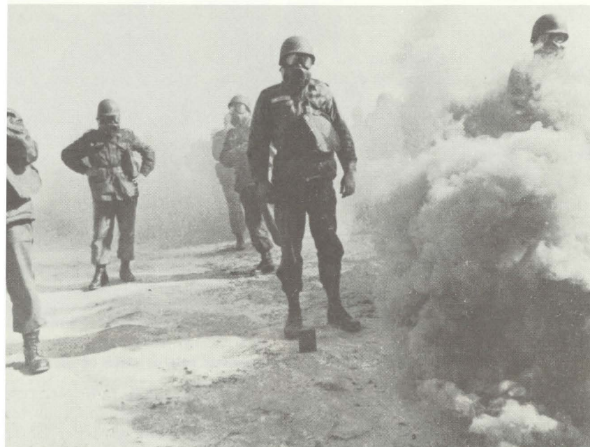
Army News Features

mediate result is a persistent muscular contraction, a state of cramp, followed by paralysis. And this is exactly what happens when the critical esterase, called acetylcholinesterase, becomes inhibited by a G-type phosphorous compound. When the block