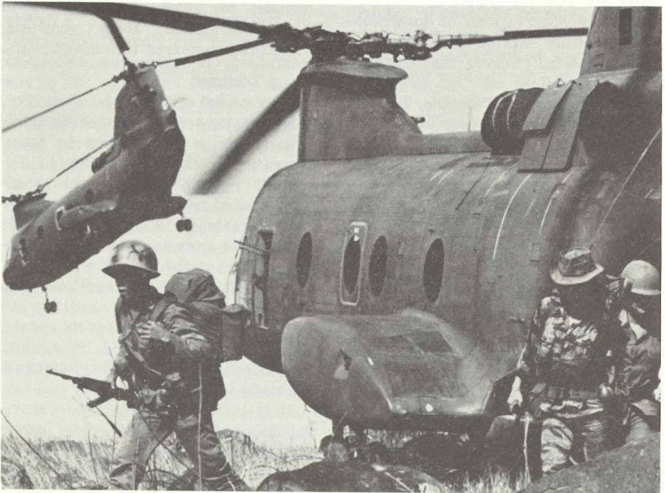
Vertol Division The Boeing Company Innate differences in vulnerability to chemical agents between different populations have led to the possible development of ethnic weapons

a poison to which Caucasoids are largely adapted. In such situations, the sketchy grid just mentioned is of some use. One looks for the possibility of the poison-provoking enzyme production, an individual adaptation observed in several instances. The poison now at issue is milk. In Europeans, intolerance to lactose, or milk sugar, occurs as a rare recessive trait. Healthy parents, each carrying a single mutant gene, have children approximately one-fourth of whom react to milk ingestion with diarrhea, vomiting, malabsorption, and even death. When reports on milk intolerance in various groups of non-European began to accumulate, it was remembered that malnourished children in east Africa got diarrhea when