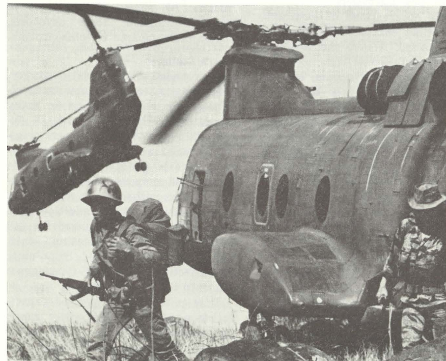
Vertol The Boeing Co.

The poison now at issue is milk intolerance, Europeans, intolerance to lactose, milk sugar, occurs as a rare recessive trait. Healthy parents, each carrying a single mutant gene, have children approximately one-fourth of whom react to milk ingestion with diarrhea, vomiting, malabsorption, and death. When reports on milk intolerance in various groups of non-Europeans began to accumulate, it was remembered that malnourished children in east Africa got diarrhea