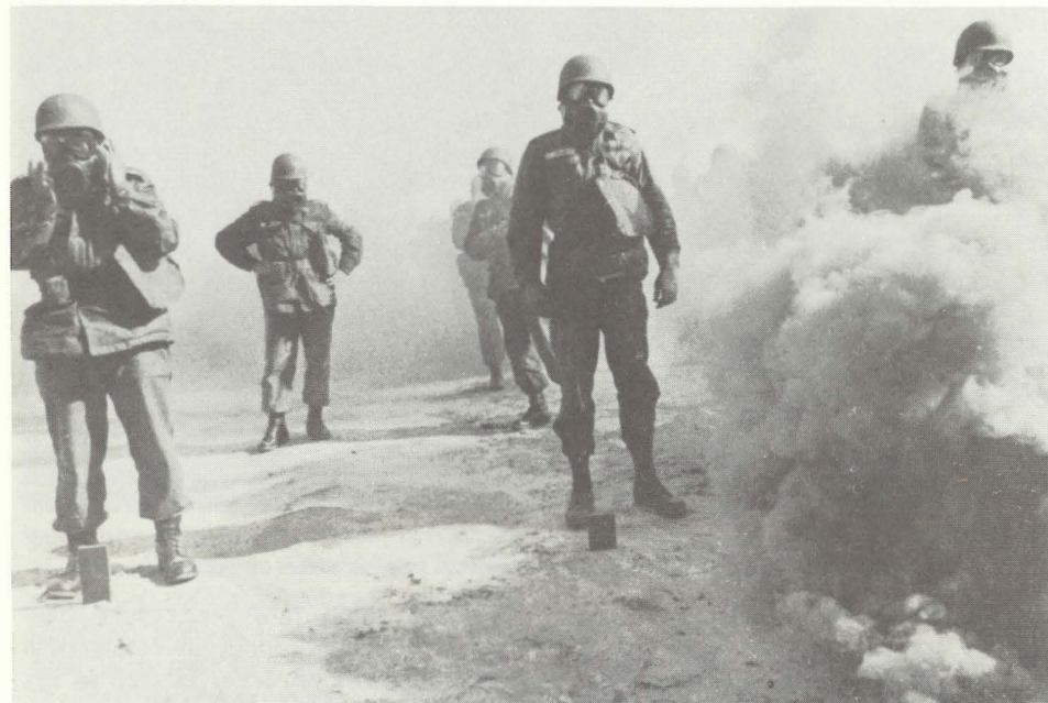
Army News Features

shorten, the signal is dispatched via a nerve which triggers numerous muscle fibers. This is done through the transcription of the nerve signal to a chemical message, acetylcholine being released at the endings of nerve fibers. As long as the flow of impulses