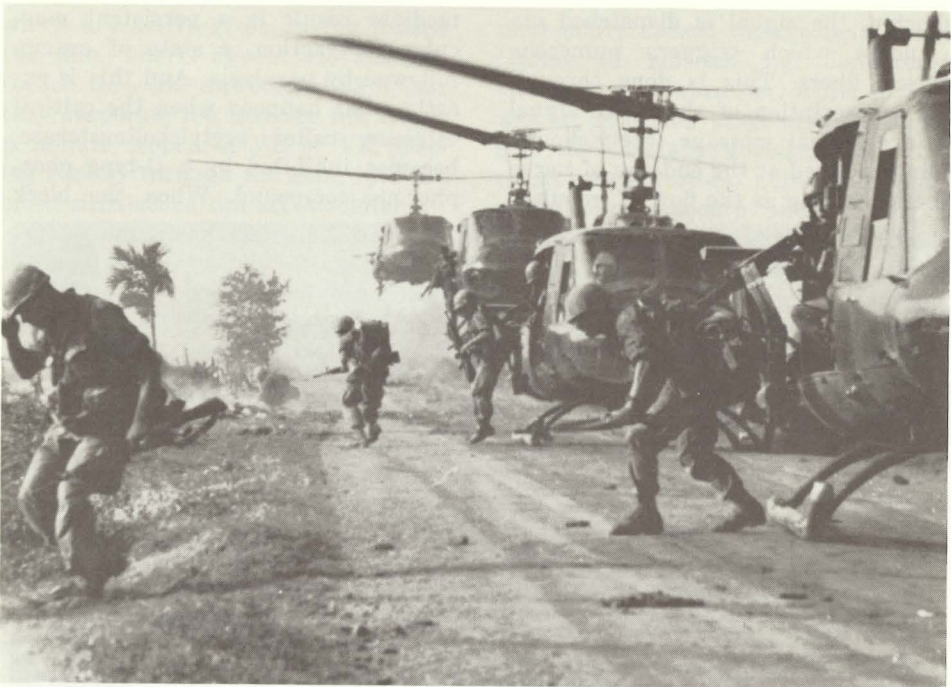
Army News Features

Besides these experiments by nature, revealing the existence of an enzyme and its determining gene by replacing the gene with an inert imitation, information about enzymes has been obtained from the study of their inhibitors. Chains of vital processes in the human body, concerned with energy provision and material replace-