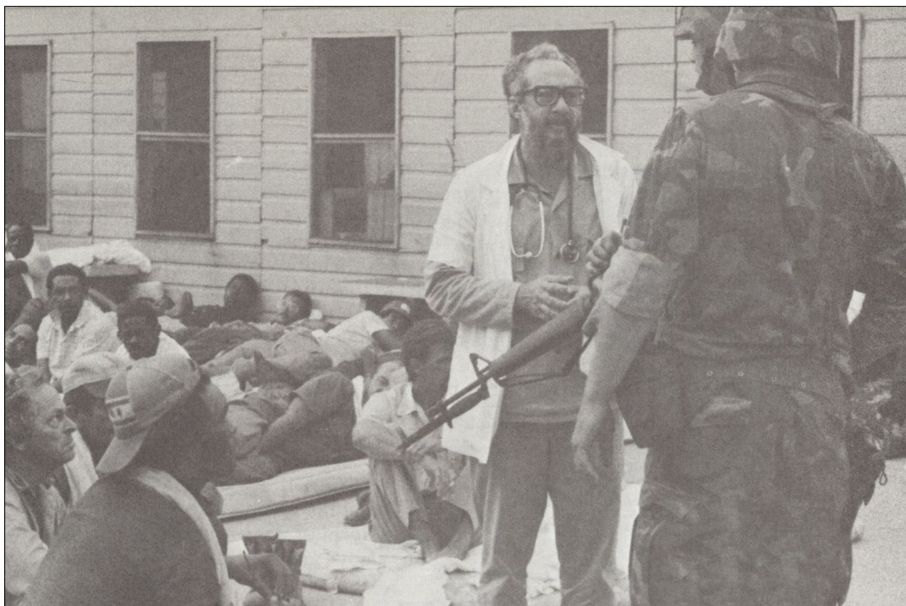
82d Airborne troops talk with a Cuban doctor in detention area, 26 October 1983.