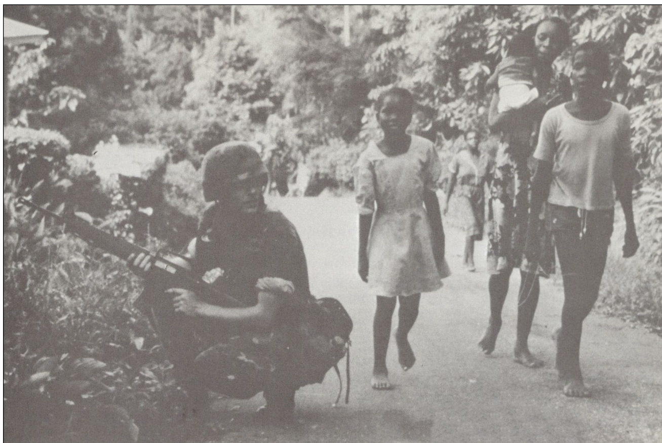
82d Airborne soldier in terrain typical of the island's interior.

The 1982 edition of Field Manual 100-5, Operations , says: "The operational level of war uses available military resources to attain strategic goals within a theater of war." 5 This level includes the allocation of forces, the deployment of troops against selected enemy forces and terrain objectives, and the command and control of engaged combat units. Each of these operational components in Grenada received criticism. It was said that too many forces were employed, the forces were deployed piecemeal against peripheral objectives and the operation was inefficiently directed. Lind observed: