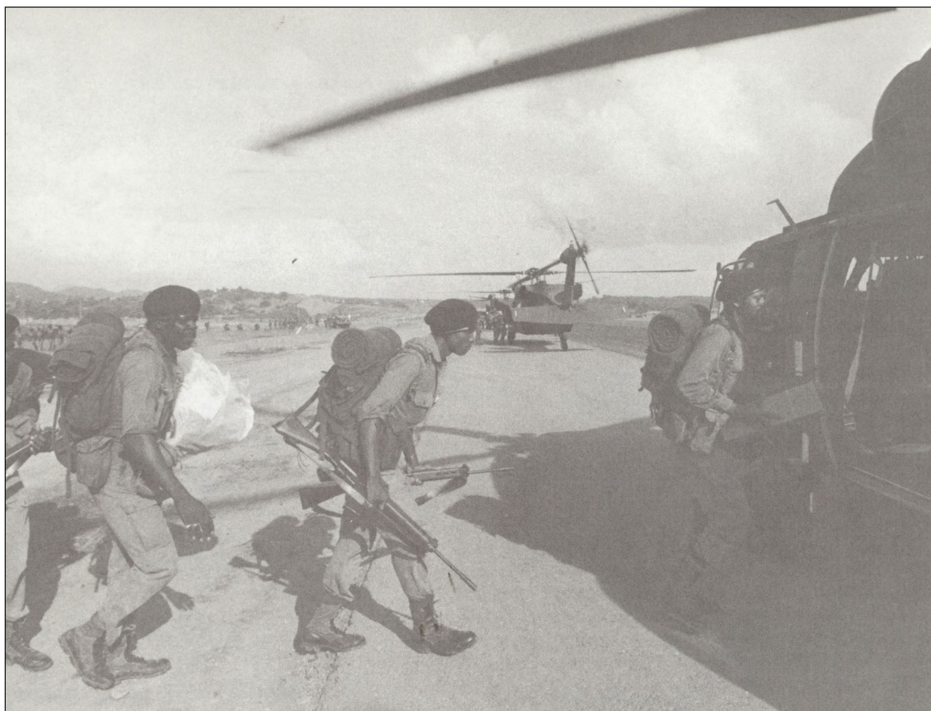
Members of the Caribbean Multinational Force board UH60 Black Hawks to take up guard positions, 25 or 26 October 1983.