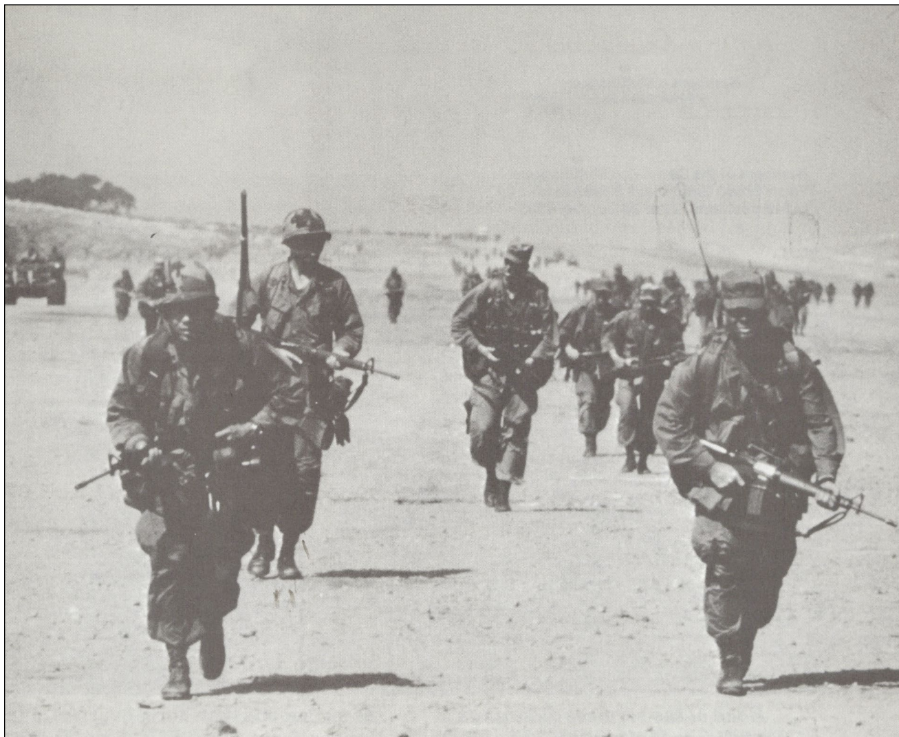
US Army Rangers deploying from Point Salines area, 26 October 1983.