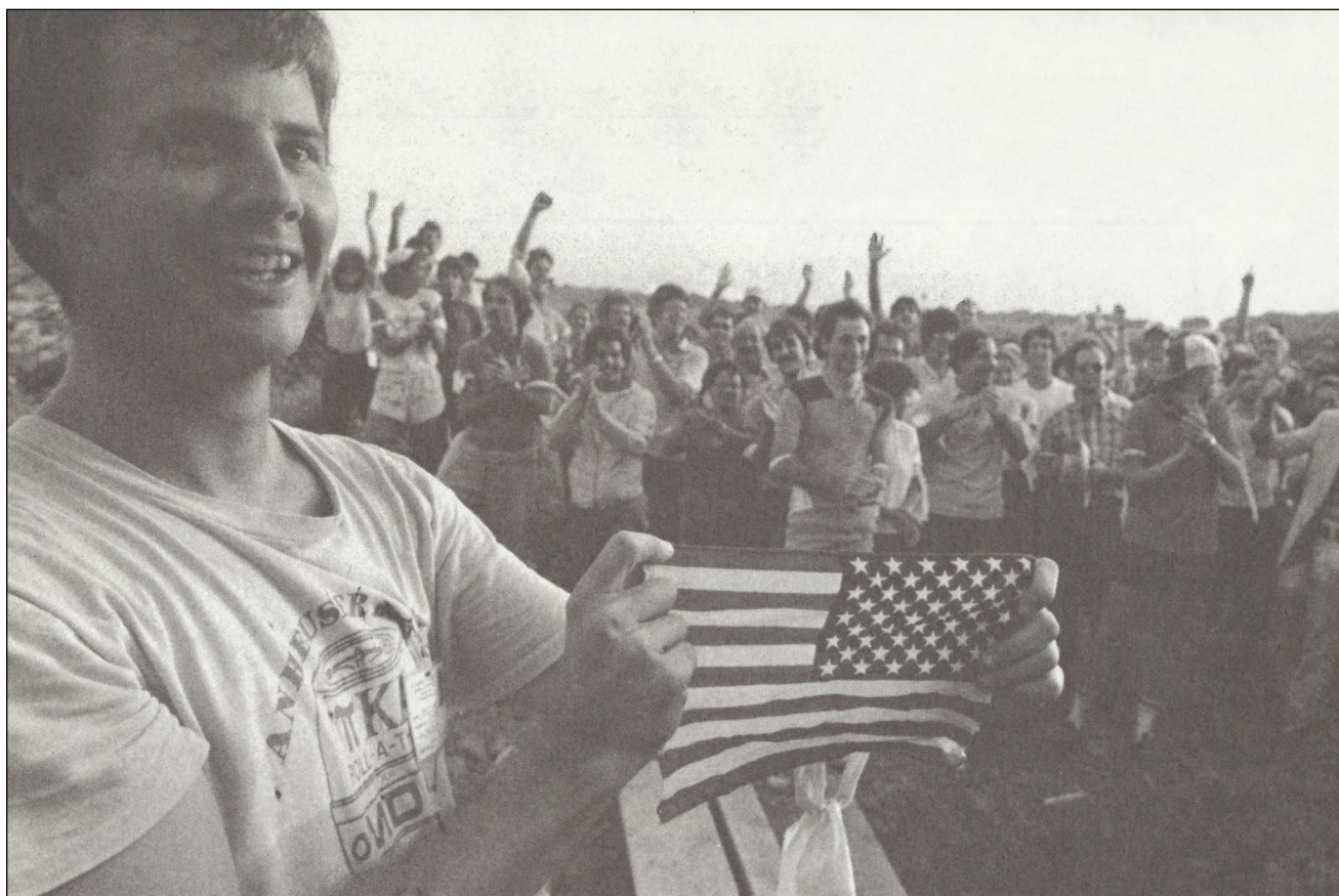
American students after their rescue by US Army Rangers, Point Salines, 25 October 1983.

required the seizure of one or more runways. Army paratroopers were the logical choice, and the Army Rangers had trained to rescue hostages. Thus, the airborne Ranger battalions were added. More infantrymen were needed to complete the clearance of the countryside, and the 82d Airborne Division was the closest source of nonmechanized troops. They also had the ability to parachute into Grenada if necessary, and their normal readiness level is higher than other available Army units.