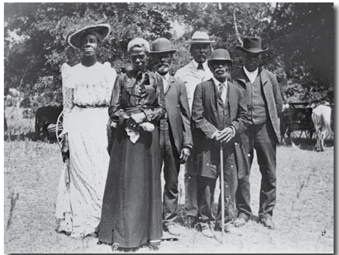
A picnic at the Emancipation Day celebration, 19 June 1900.

The next 100 years. Juneteenth represents our quest. Make freedom the last frontier. Our grandchildren silently smile, As June 19th now endears.