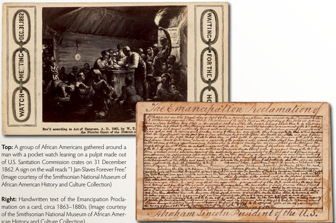
Top: A group of African Americans gathered around a man with a pocket watch leaning on a pulpit made out of U.S. Sanitation Commission crates on 31 December 1862. A sign on the wall reads "1 Jan-Slaves Forever Free."

Juneteenth is for you, Juneteenth is for me, Our histories not aligned. Regardless of each journey, Our futures are intertwined. I hear ancestral voices ask: "America, will thine be mine?"