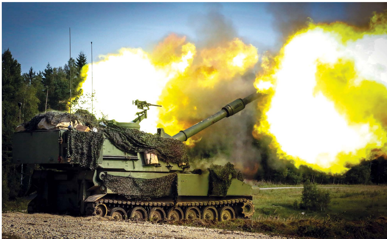
Soldiers of 3rd Armored Brigade Combat Team, 4th Infantry Division fire an M109A6 Paladin howitzer 21 August 2017 during Exercise Combined Resolve IX at the Grafenwoehr Training Area in Germany.

future theater armies are tailored to their respective theaters and operational support of Army missions defines their functions, their versatility is limited. Similarly, a future field army is sharply focused on succeeding in competition below armed conflict against a specific peer threat within the theater and setting conditions to rapidly transition to armed conflict as a multi-corps land component command. Meanwhile, future divisions maintain an uncompromising emphasis on readiness for the task of integrating multiple brigade combat teams (BCTs) and enabling formations as a highly-lethal, tactical formation to win the close fight during armed conflict. This limits some aspects of versatility at the division level. The future corps, functioning as the link between the operational and tactical levels of war, emerges as the echelon that affords the greatest potential for adaptation in response to the uncertainty of both future threats and the environment. This agility mitigates the operational risk naturally found in warfare when predictions of the future OE frequently fail to match reality.