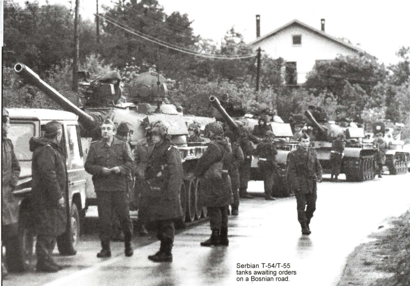
Serbian T-54/T-55 tanks awaiting orders on a Bosnian road.

There is some debate as to whether the rapid retreat of Vojska forces throughout autumn 1995 was . . . part of the Serb negotiation strategy during the talks to end the war. This idea supports reports by European observers that the Serbs had retreated without pressure. The Serb decision to withdraw ostensibly calculated that the land relinquished would eventually be given up anyway. . . . However, it was also at this point that the Croatian Army decided not to undertake any further operations.