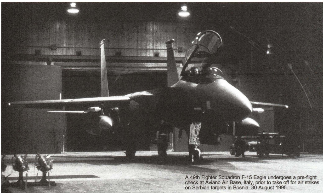
A 49th Fighter Squadron F-15 Eagle undergoes a pre-flight check at Aviano Air Base, Italy, prior to take off for air strikes on Serbian targets in Bosnia, 30 August 1995.

NATO aircraft served as de facto close air support for the allied forces, complementing the ground attacks. Indeed, the strikes created a dilemma for Vojska commanders during the initial days of the allies' operations. When their forces attempted to maneuver rapidly, they exposed themselves to losses from the air interdiction. When measures were imposed to counter the air interdiction, they could not move fast enough to counter the ground threat.