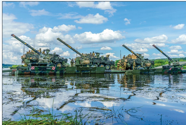
Cover photo: Elements of the 2nd Cavalry Regiment aboard German M3 Amphibious Bridging Vehicles cross the Nemen River 13 June 2018 during Saber Strike 18 near Kulautuva, Lithuania.

JAMES C. MCCONVILLE General, United States Army Chief of Staff