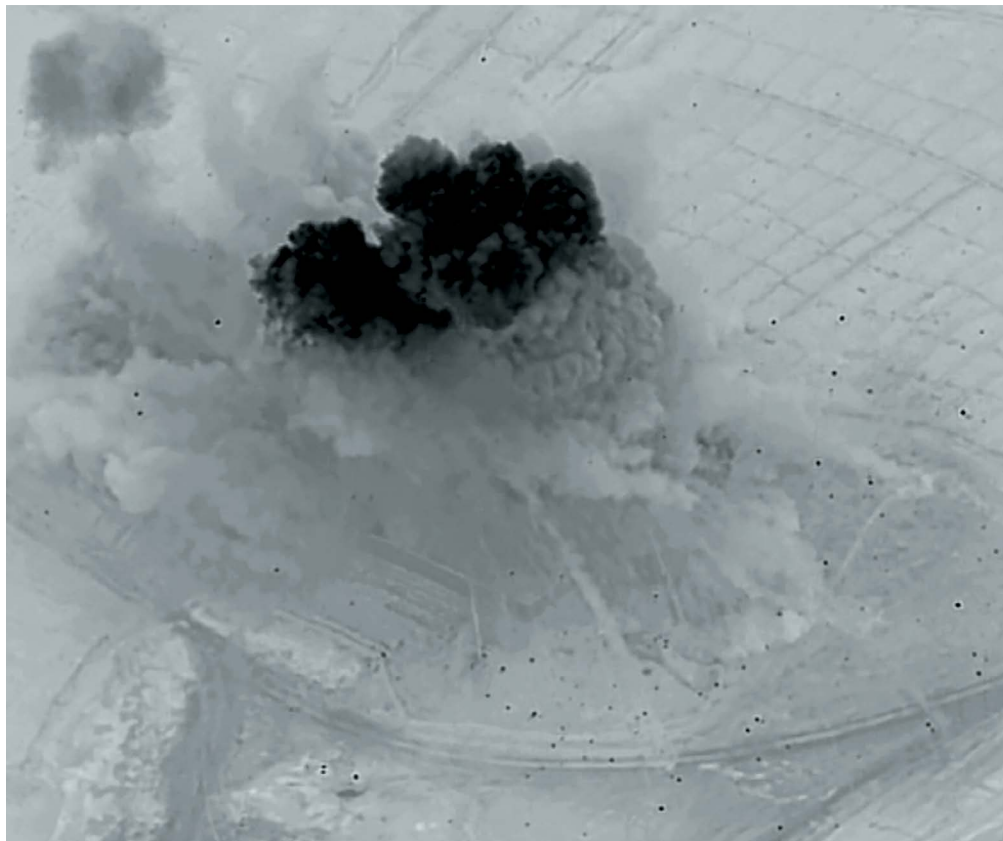
A U.S. Air Force A-10 strikes a Taliban narcotics facility 3 April 2018 in Farah Province, Afghanistan. U.S. forces and Afghan National Defense and Security Forces seized and/or destroyed select narcotics production and trafficking nodes throughout the course of the conflict to reduce the insurgent forces' ability to procure financial resources.

On 9 October 2019, Americans woke up to the headline “U.N. Report Says U.S. Air Strikes on Afghan Drug Labs Unlawful, Hit Civilians.” 22 Similar stories populated newsfeeds in Afghanistan, pan-Arab media, Europe, and China. 23 At issue was a United Nations Assistance Mission in Afghanistan (UNAMA) report accusing U.S. forces of violating LOAC by striking drug labs that were alleged to have been used to fund Taliban operations. 24 In short, the authors of the UNAMA report mischaracterized the law.