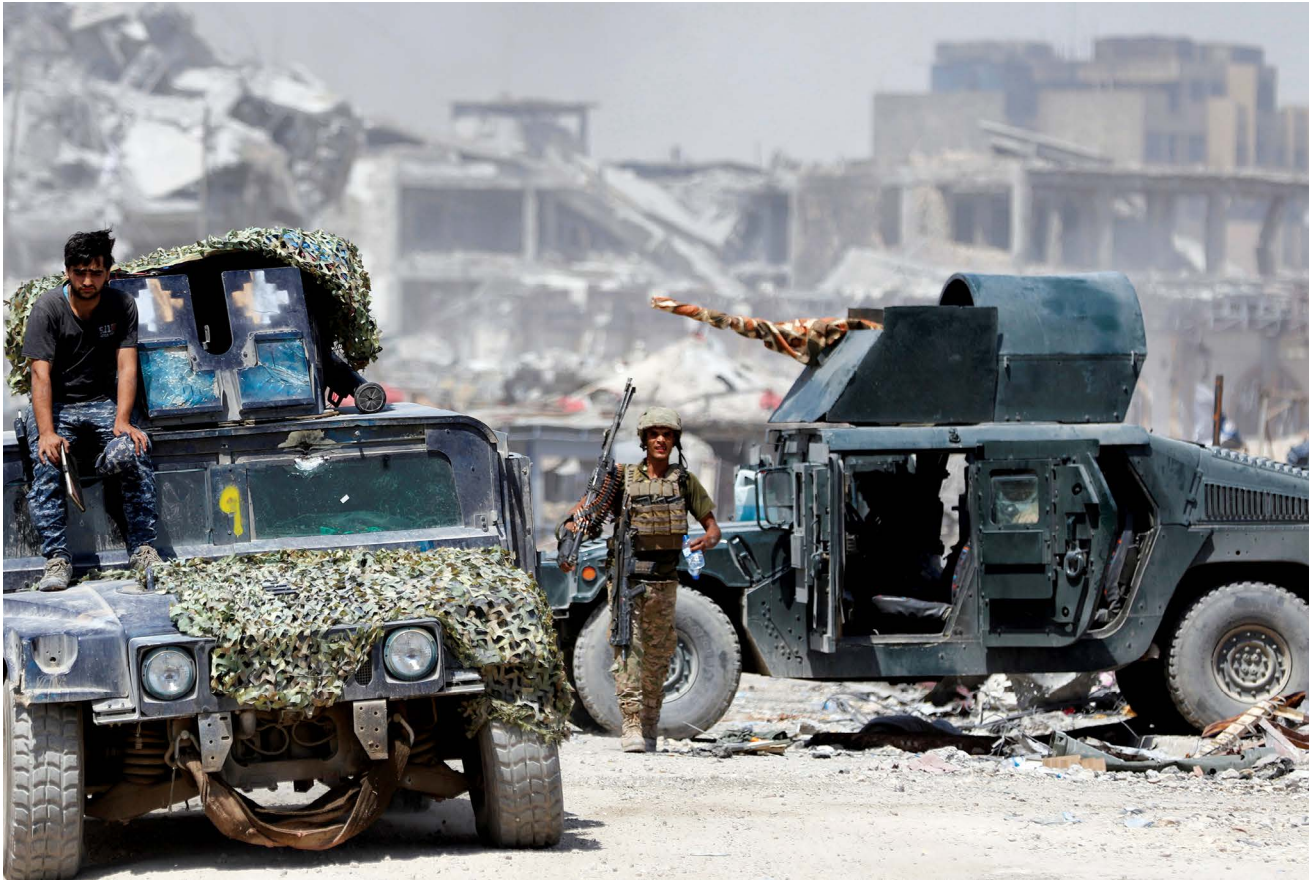
Iraqi security forces carry their weapons 6 July 2017 during fighting between Iraqi forces and Islamic State militants in the Old City of Mosul, Iraq.

As an initial matter, it is not at all clear that a blanket rule banning a particular weapon or tactic will always prove more humane in all circumstances. This is not to deny the horrendous stories from Raqqa, Sana'a, and Aleppo in Syria; Donetsk in Ukraine; and elsewhere that prompt the humanitarian actors to advocate for civilian protection. 42 But the Army is a learning organization, and military scholars specializing in urban combat have noted that the use of low-yield explosives and precision munitions may well actually extend and expand urban combat, leading to greater suffering and death. The battle for Mosul in 2017 is but one recent example of the dangers of writing overly prescriptive rules for the wrong war. Mosul was a highly urban operation where Islamic State tactics leveraged the urban terrain. The actual battle revealed that speed and decisive firepower, including high explosives, brings the battle to a conclusion more swiftly with less loss of civilian life or damage to civilian property than if the battle had been prolonged by different, more cautious means. 43