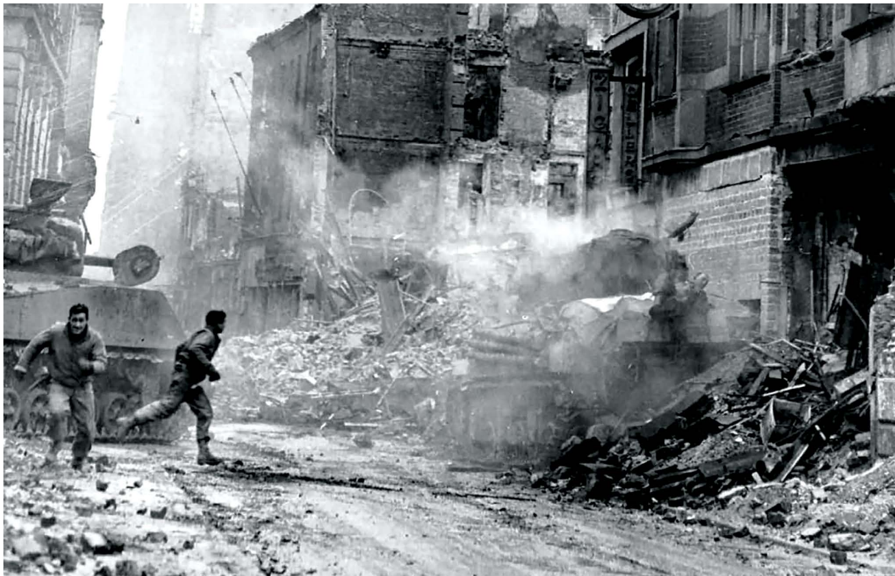
Tank crewman of the 3rd Armored Division leave their M4 Sherman ( left ) to check on survivors of an accompanying Sherman tank ( right ) that was struck by fire from a German Panther tank and seek medical aid 6 March 1945 during the fight for control of Cologne, Germany.

This manual distills the legal rigor of the detailed, three-volume DOD Law of War Manual into language easily understood by individual soldiers and marines. It reflects the Army and Marine Corps' interpretation of how to conduct land warfare lawfully, responsibly, and humanely. This serves as evidence of our standard. As the foreword states, "Adherence to the law of armed conflict ... must serve as the standard that we train to and apply across the entire range of military operations." 56 This manual represents our state practice and fundamentally, our national values.