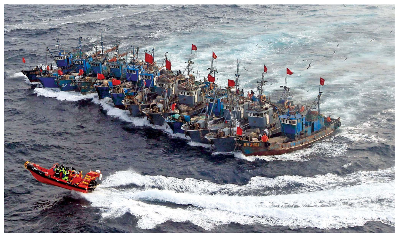
Twelve Chinese fishing boats are banded together with ropes 21 December 2010 to try to thwart an attempt by a South Korean coast guard ship to stop their alleged illegal fishing in the Yellow Sea off the coast of South Korea.

India's consistently positive trade balance with the United States earns it a more favorable perception than India's consistently negative trade balance with China. In a future conflict, reinforcing cooperation with India offers a key pathway to fortify the region, and early effort by the joint force in this line of effort will provide strategic advantage.