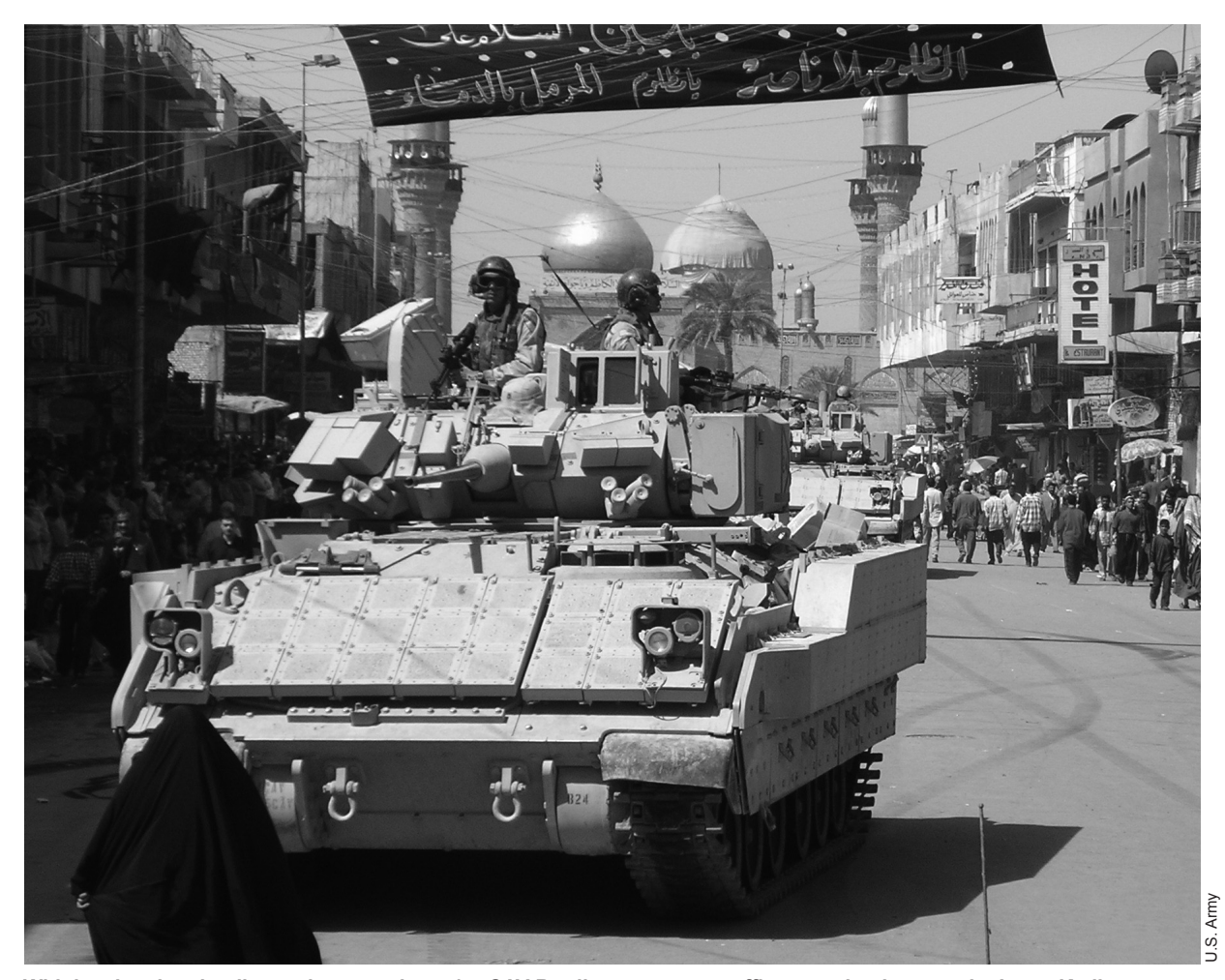
With local national police and army units, a 1-5 CAV Bradley secures a traffic control point near the Imam Kadhum Mosque, March 2004.

The kinetic COIN fight mostly plays out at the squad and platoon levels. But COIN does not guarantee low intensity. As combat operations in Najaf and Fallujah in 2004 (inter alia) showed, counterinsurgent forces need to be able to transition to high-intensity conflict. This show of force is the fundamental key in the information operation that sets the baseline for the maneuver battalion's success. By being the provider of security or, conversely, the implementer of targeted violence, and by being able to surge or reduce presence in various neighborhoods or around various structures, the