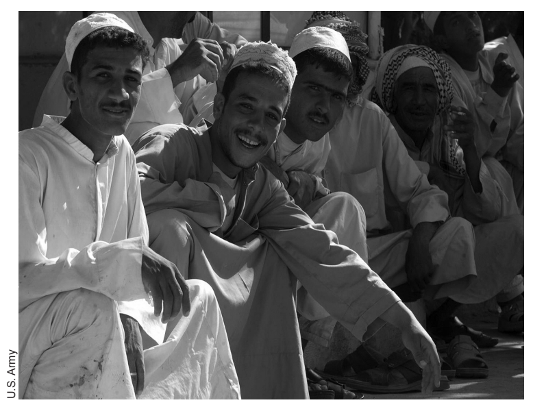
Residents of Najaf celebrate the ending of the Madhi Militia uprising in Najaf, August 2004.

getting fathers and mothers to work and sons and daughters to school.<sup>6</sup>