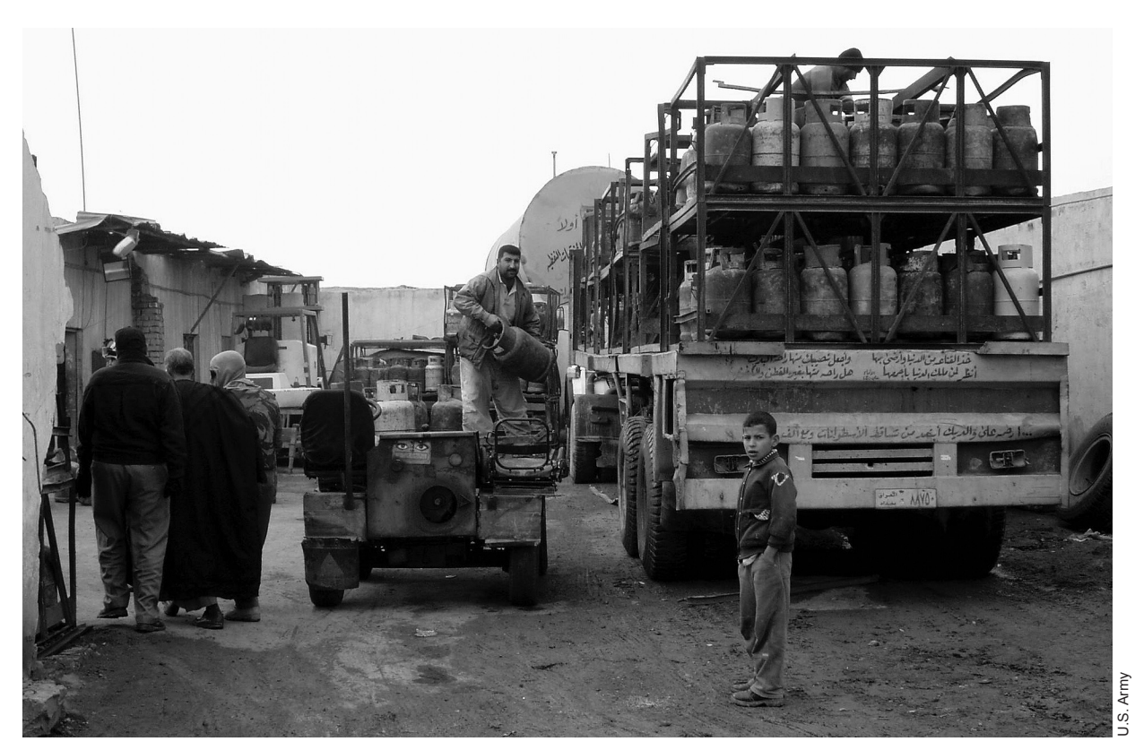
Looking out for the small businessman, a 1-5 CAV patrol checks in on a local propane distributor.

knowledge regarding local problems, local needs, local resources, local development potential, as well as local motivation for promoting change, exists on the local level [and] it is of fundamental importance that the local community sees its place in the future."<sup>17</sup>