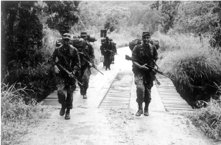
Army of Brazil

Despite great advances in warfighting technology in the last few decades, the combat Soldier is still the essential element on the battlefield.