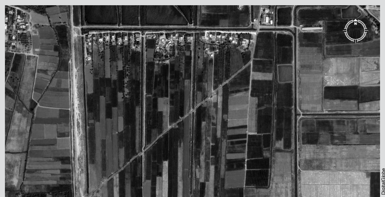
A recent aerial view of strip fields in a village near Yusufiya, central Iraq.

Research of field patterns in iron-age Northern Europe and in contemporary East Africa has shown that strip parcels are generally associated with lineage-based communities. In such communities, the allocation of the strips often mirrors the family tree of the land-owning group and reflects the genealogical ranking of its members: older sons own strips of land (or sections of the family's strip of land) that are closer to the family dwelling than those owned by younger sons, while owners of strips on the right, when viewed from the dwelling, are senior to owners of strips on the left. Adjacent strips of land are generally owned by brothers, and adjacent plots of land are often owned by cousins (unless sold to an outsider).85 Further investigation is required to determine whether such practices are followed in Iraq. If so, it may prove to be yet another bit of cultural knowledge that can help coalition forces locate insurgent weapons caches, and aid coalition military operations in Iraq.