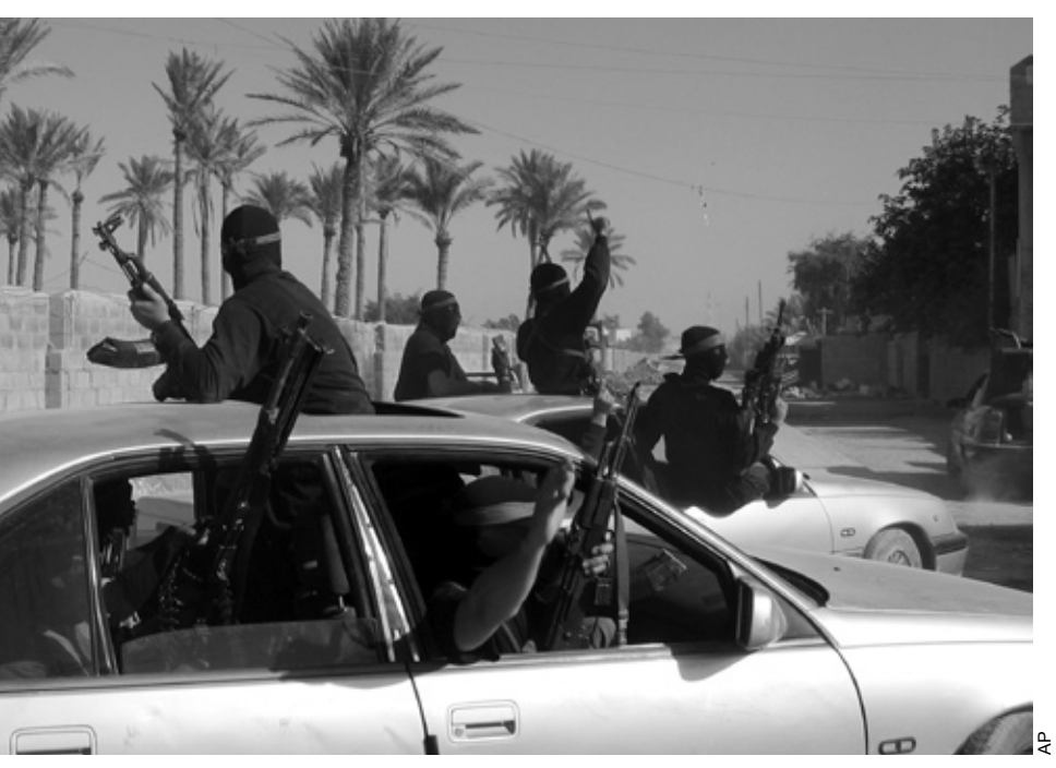
Armed militants drive through Ramadi, Iraq, 5 December 2006.

U.S. Marine Corps aircraft arrived overhead to perform "show of force" sorties designed to intimidate the insurgents and convince them that air attack was imminent. Next, a ground reaction force from Task Force 1-9 Infantry began preparations to move to the area and establish defenses for the Albu Soda tribe. Because we were viewing the area using aerial sensors, our vision of the fight was indistinct, and we were unable to separate insurgents from the friendly tribesmen. We did not want to attack the friendly tribe by mistake, so we undertook actions to intimidate the insurgents by firing "terrain denial" missions. Explosions in empty nearby fields raised the possibility of suppressive artillery fire in the minds of the enemy. Complemented by the roar of fighter jets, the startled AQIZ forces became convinced that massive firepower was bearing down on them. They started to withdraw, separating themselves from their victims.