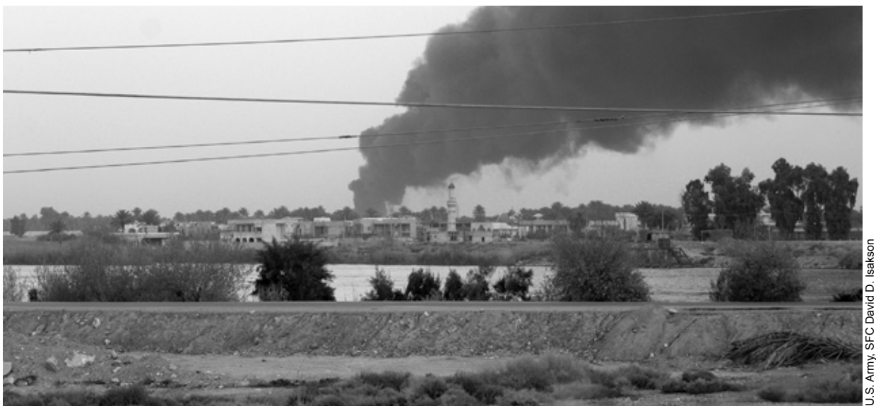
A smoke plume caused by a terrorist attack at the government center in downtown Ramadi, Iraq, 13 March 2006.

In late 2005, the Sunni tribes around Ramadi attempted to expel Al-Qaeda in Iraq (AQIZ) after growing weary of the terrorist group's heavyhanded, indiscriminate murder and intimidation campaign.<sup>3</sup> A group calling itself the Al Anbar People's Council formed from a coalition of local Sunni sheiks and Sunni nationalist groups. The council intended to conduct an organized resistance against both coalition forces and Al-Qaeda elements, but, undermanned and hamstrung by tribal vendettas, it lacked strength and cohesion. A series of tribal leader assassinations ultimately brought down the group, which ceased to exist by February 2006. This