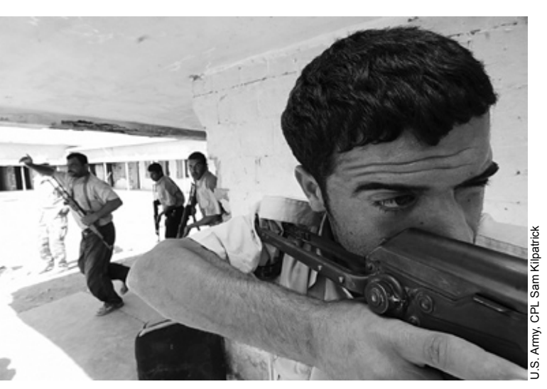
Iraqi police recruits guard the perimeter during closequarters combat training at the police training academy in Ramadi, Iraq, 25 September 2006.

Developing the plan. We reckoned the brigade had to isolate the insurgents, deny them sanctuary, and build Iraqi security forces, especially police forces, to succeed. The staff developed a plan that